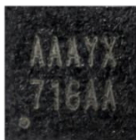
Figure 2. LAG019 in UQFN16 Package