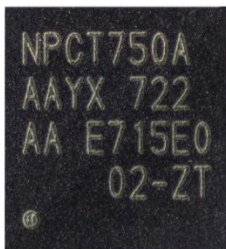
Figure 1. LAG019 in QFN32 Package