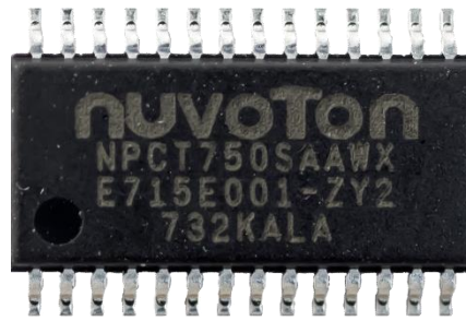
Figure 3. LAG019 in TSSOP28 Package

The physical cryptographic boundary of the Module is the outer boundary of the chip packaging.