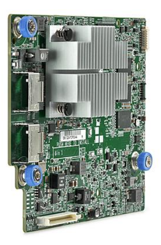
Figure 4 – P440ar Controller