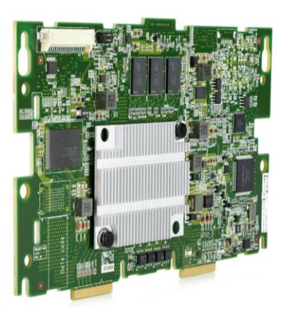
Figure 1 – H240nr Adapter