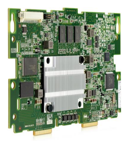
Figure 2 – P240nr Controller