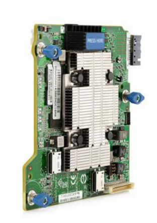
Figure 5 - P542D Controller