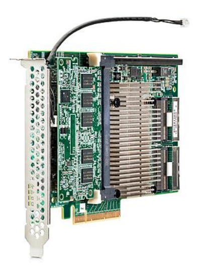
Figure 6 - P840 Controller