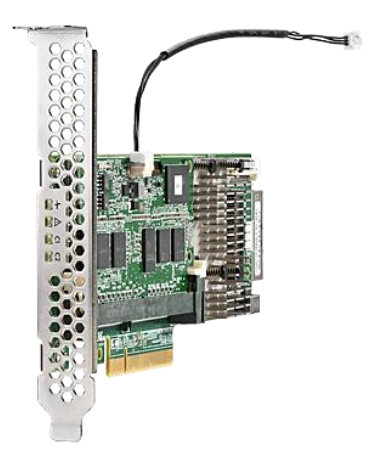
Figure 3 - P440 Controller