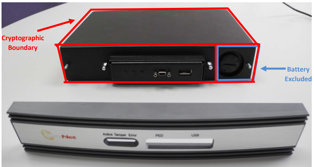
Figure 2-2. SafeNet USB Cryptographic Boundary (with front bezel removed)