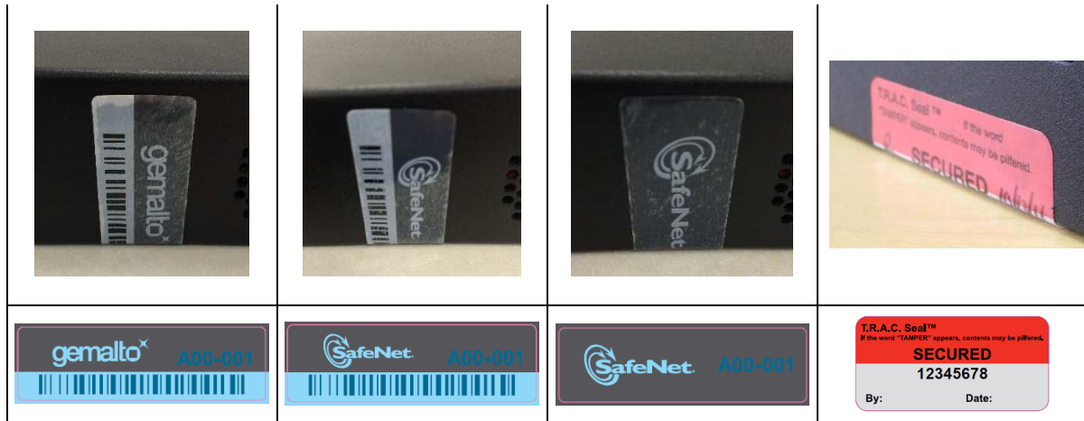
Table 3-9. TEL-GEMALTO, TEL-SAFENET, TEL-SAFENET-2 and TEL-TRAC Tamper Evident Labels

Tamper evident labels are applied to the module during the manufacturing process. The Security Officer should perform a visual inspection of the tamper evident labels for evidence of tamper.