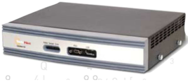
Figure 2-1. SafeNet USB Hardware Security Module

This Security Policy is specifically written for the SafeNet PCIe Hardware Security Module in a Trusted Path Authentication (FIPS Level 3) configuration.