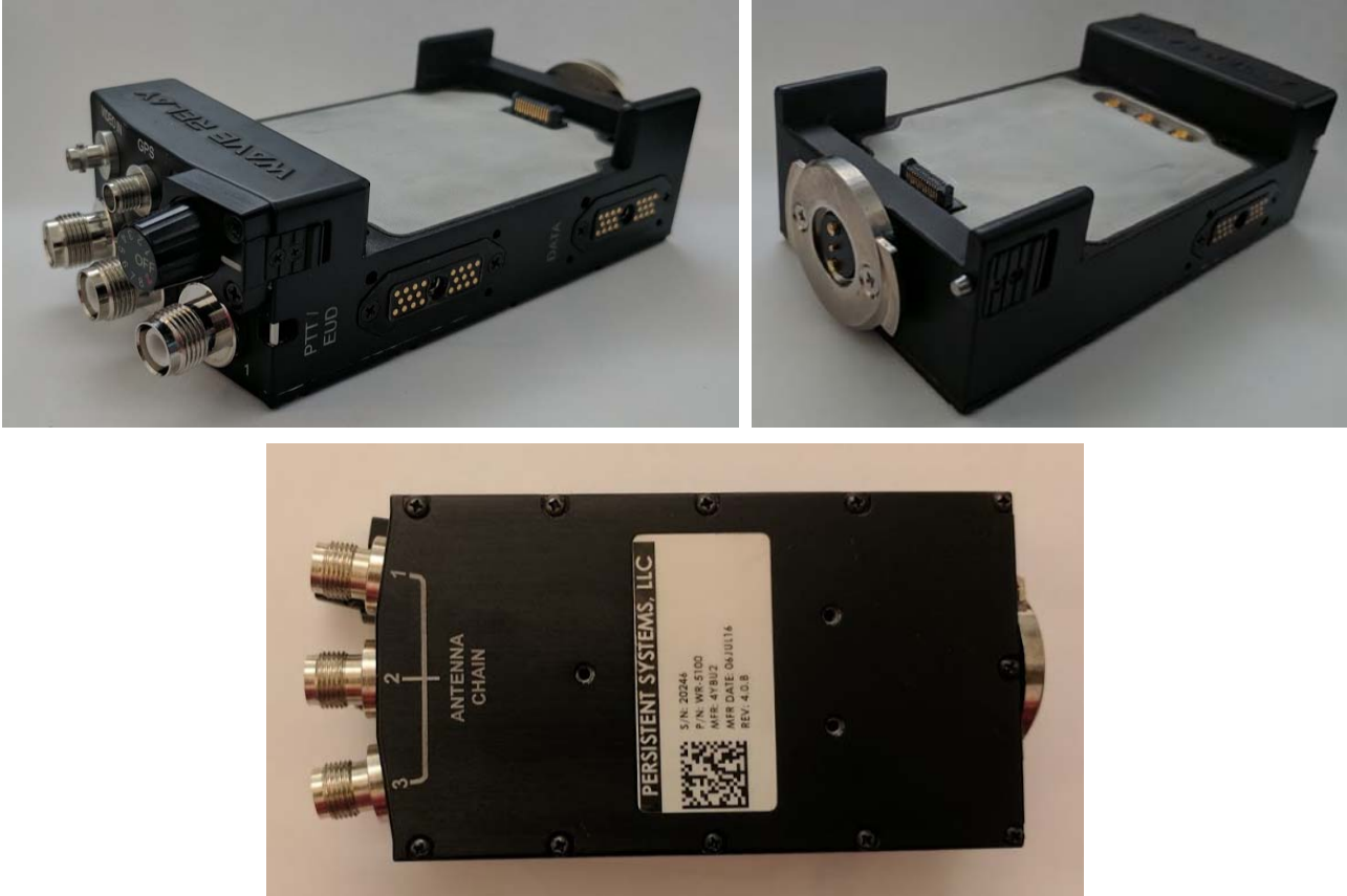
Figure 1 – Physical Boundary of MPU5

The module is in FIPS-approved mode of operation when the validated firmware is used and when only Approved/allowed functionality is used. Tamper-evident material must also be applied per the instructions in Section 3.1.3. It does not have any bypass capability.