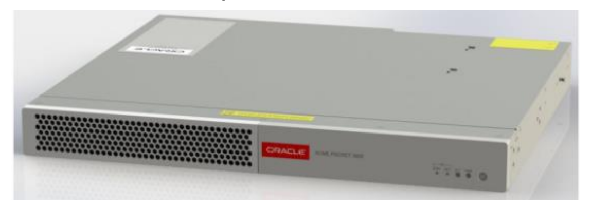
Figure 2: Acme Packet 3900