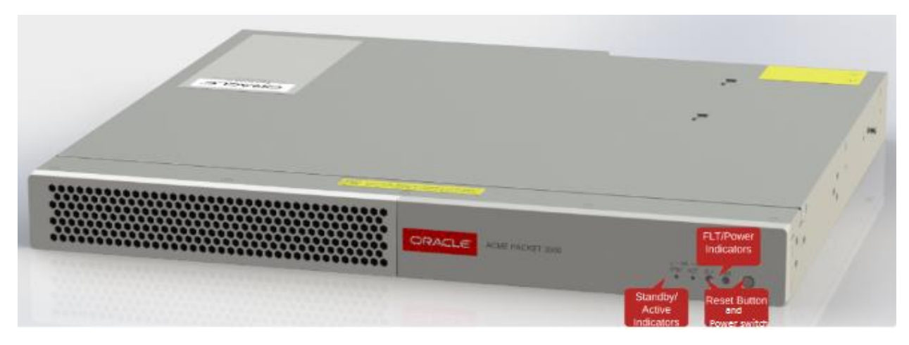
Figure 5: Acme Packet 3900 - Front View