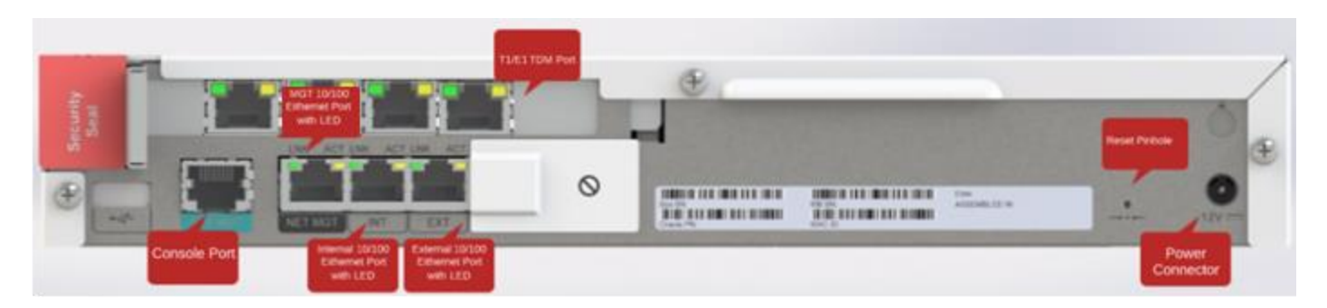
Figure 4: Acme Packet 1100 - Rear View