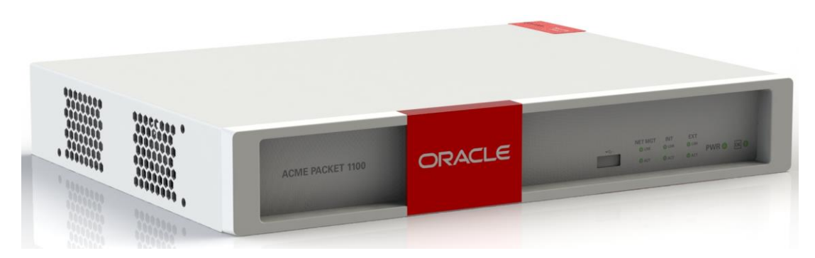
Figure 1: Acme Packet 1100

A representation of the cryptographic boundary is defined below: