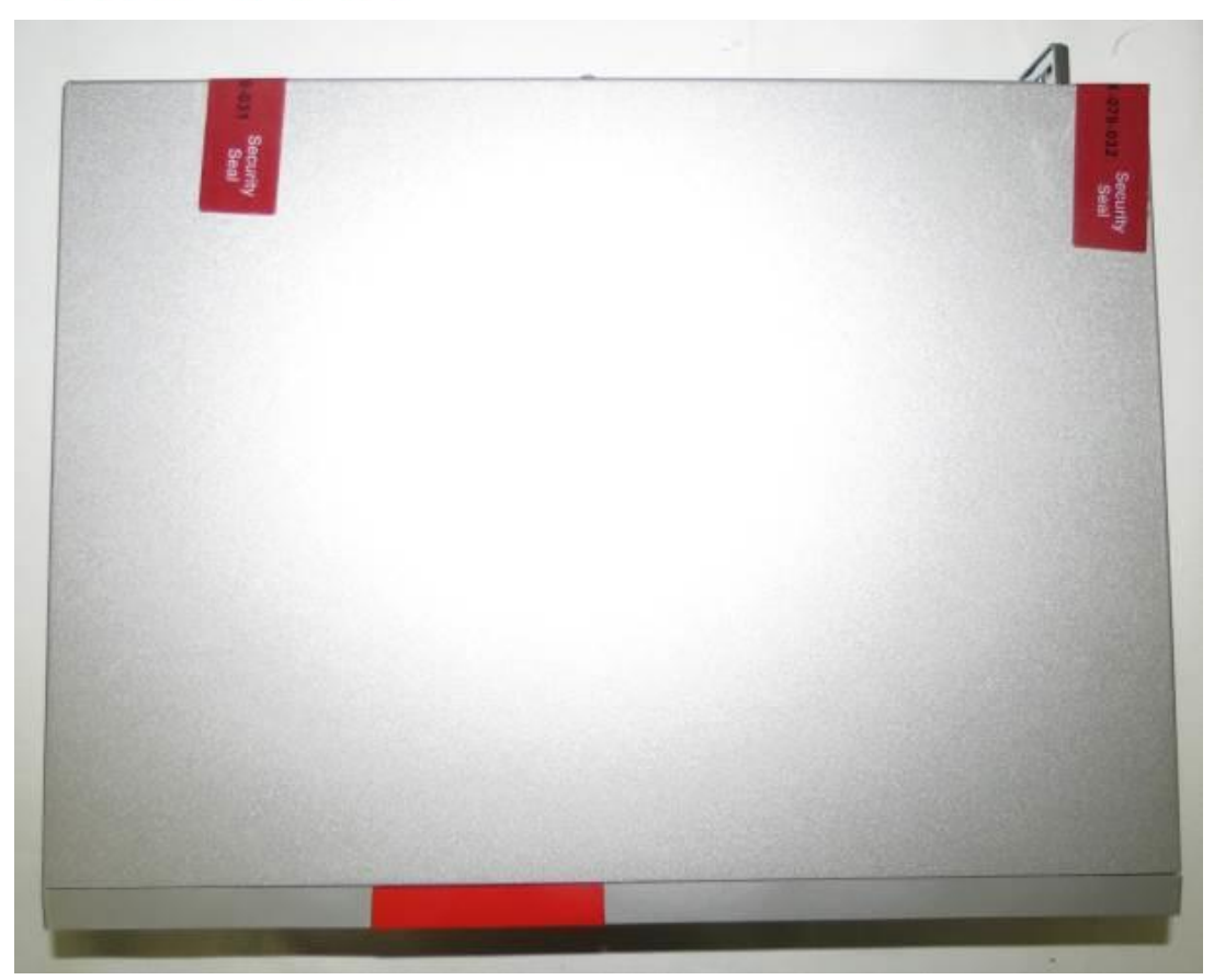
Figure 8: Top side of Acme Packet 1100