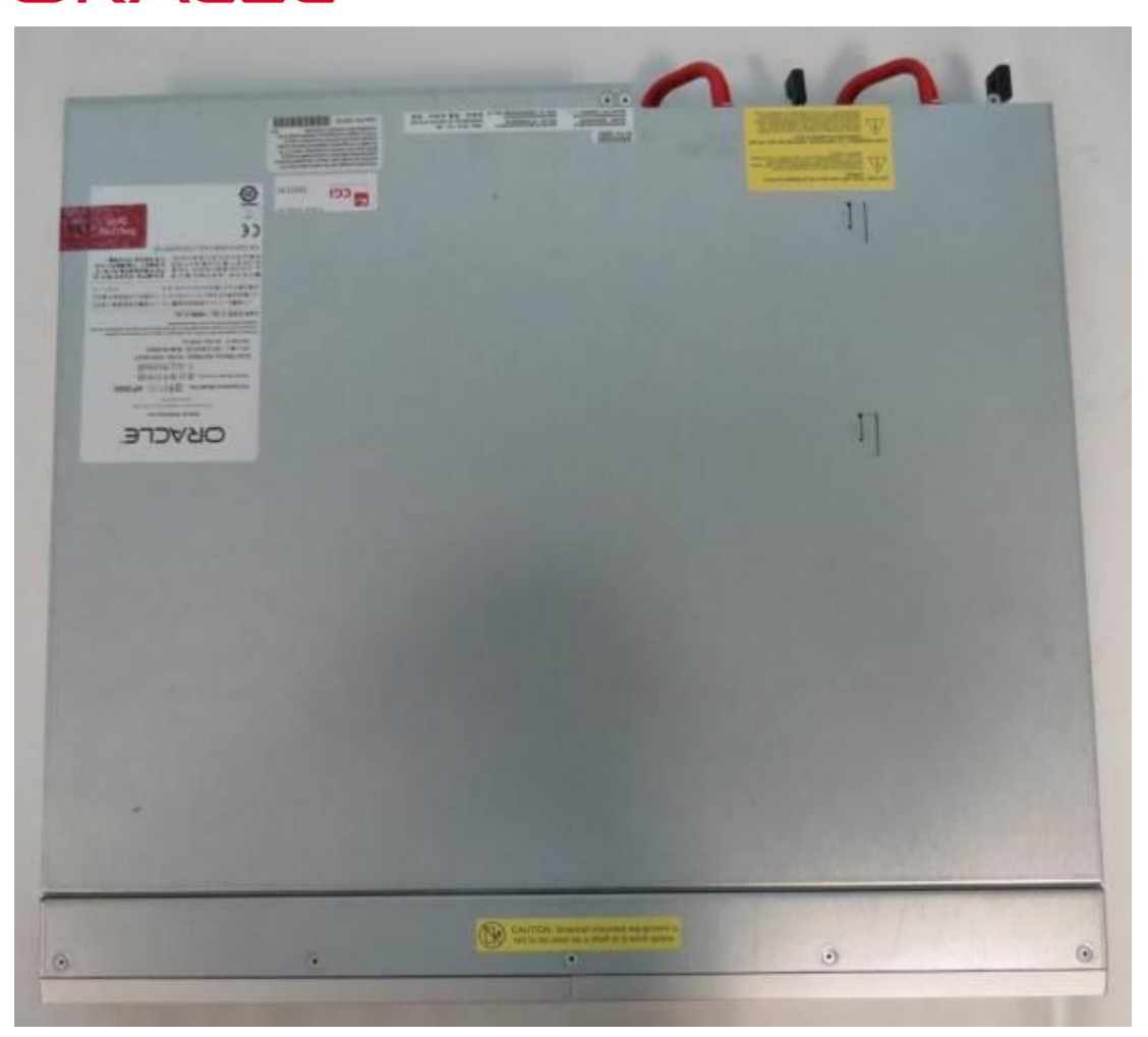
Figure 11: Top side of Acme Packet 3900