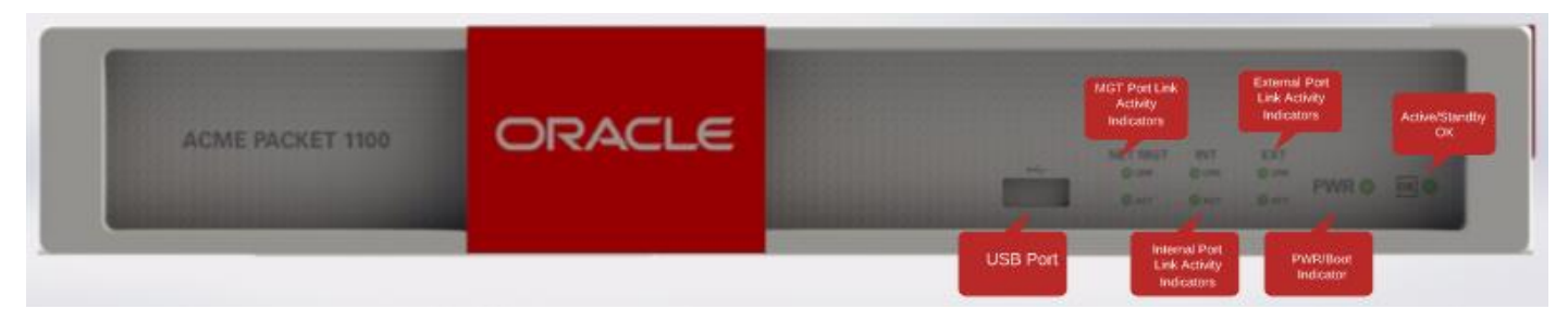
Figure 3: Acme Packet 1100 – Front View