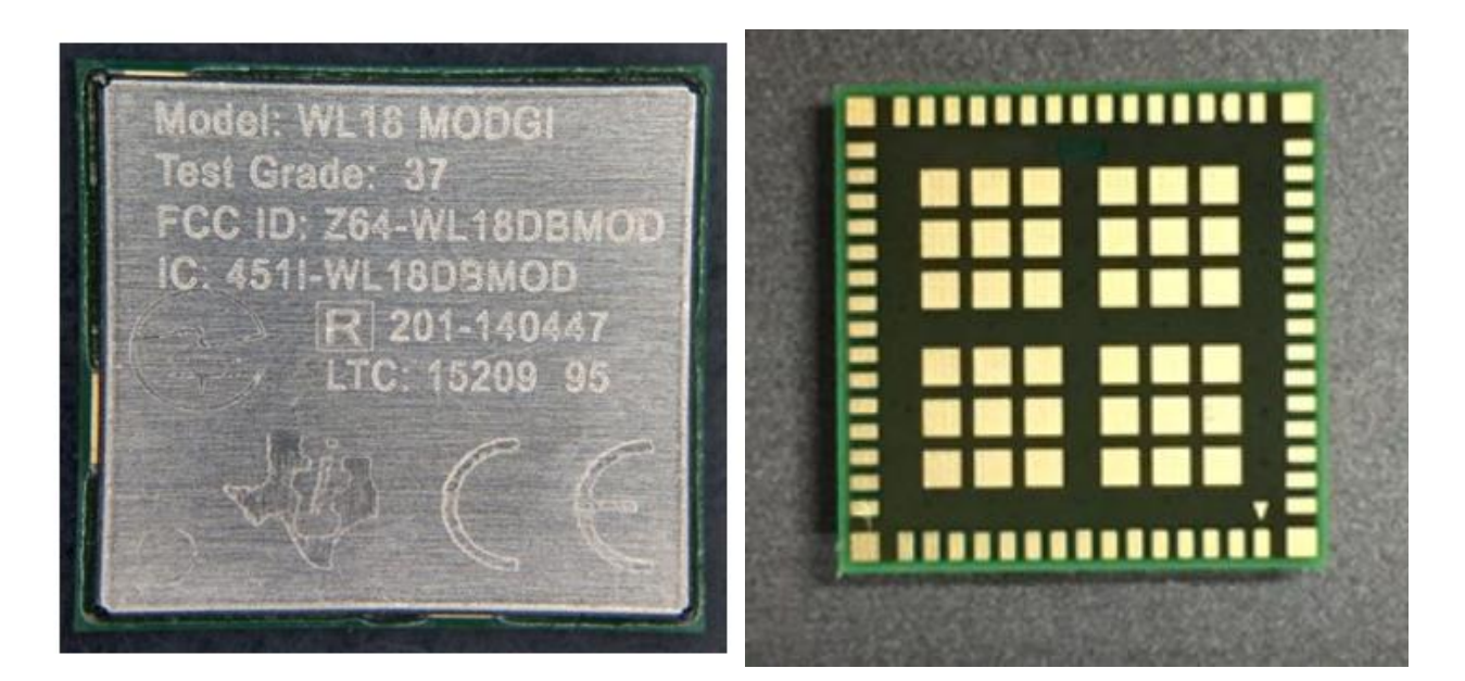
Figure 2 – Front and back views of the TI WiLink<sup>™</sup> 8 chip.