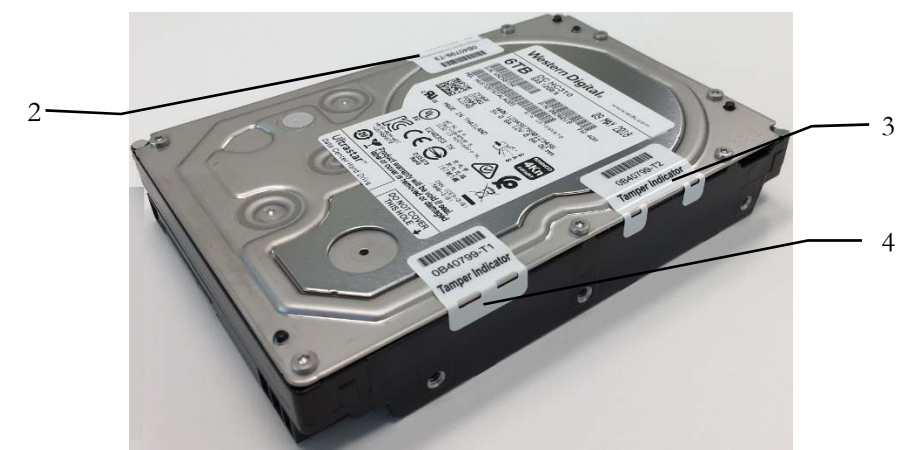
Figure 3: Tamper-Evident Seal over PCBA