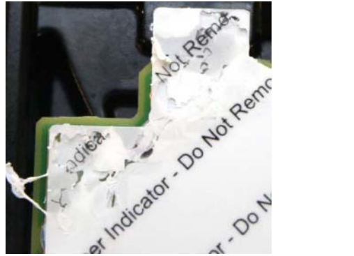
Figure 5: Tamper Evidence on Tamper Seals

The Crypto Officer shall inspect the Cryptographic Module enclosure for evidence of tampering at least once a year. If the inspection reveals evidence of tampering, the Crypto Officer should return the module to Western Digital.