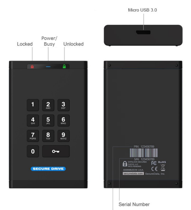
Part Number (some products)