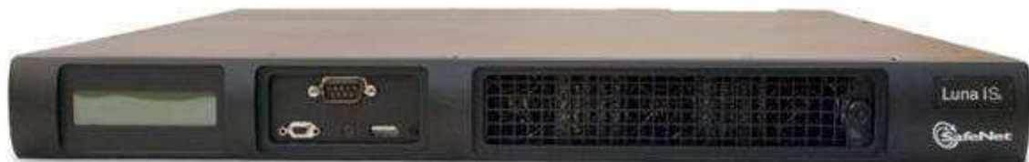
Figure 2-2. SafeNet IS with SafeNet PCIe Installed