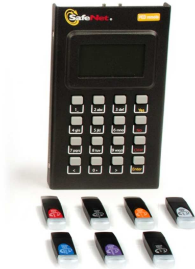
Figure 3-1. SafeNet PED and iKeys