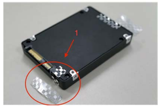
Exhibit 14 – Signs of Tamper