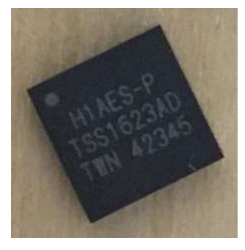
Figure 1 - Titan Security Key, Chip Boundary (Front)

The cryptographic boundary is the outer perimeter of the chip shown in the below figure. The device is a single-chip module as defined by FIPS 140-2. The hardware version of the module is H1B2.