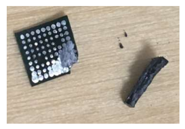
Figure 4- Tamper Evidence and damage to the module

The module hardness testing was performed at a single ambient temperature of 72 °F. No assurance is provided for Level 3 hardness conformance at any other temperatures.