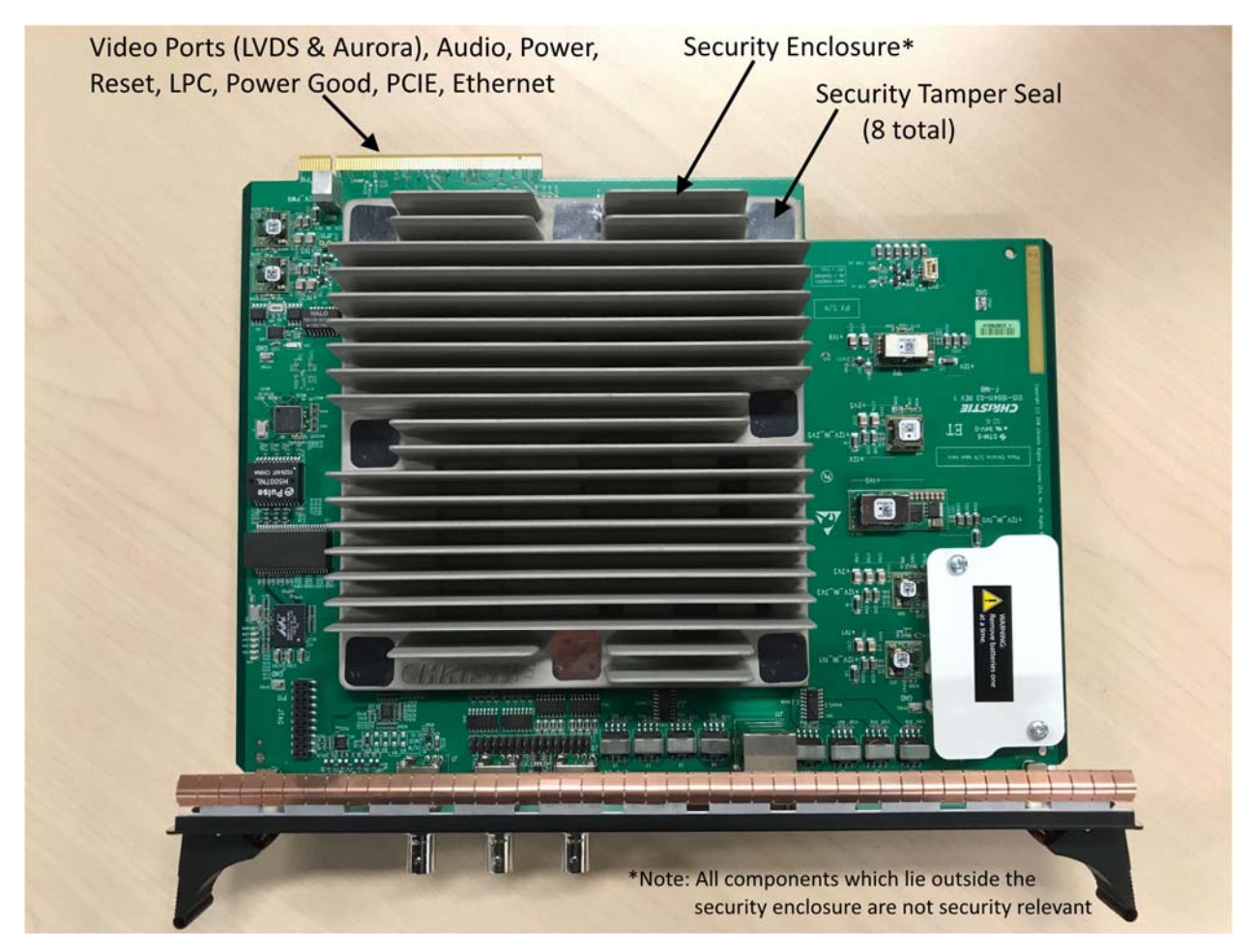
Figure 2 Top View of Christie IMB-S3