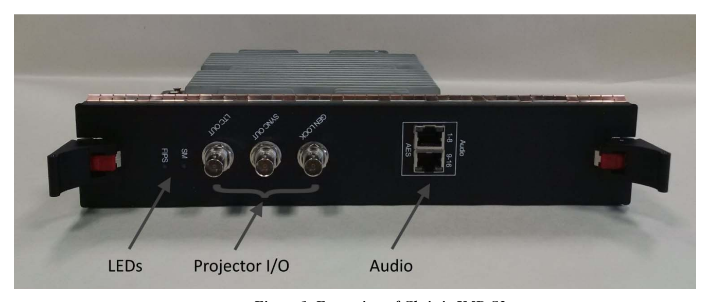
Figure 1 Front view of Christie IMB-S3

Everything outside the metal Security Enclosure is excluded from FIPS 140-2 Requirements. Unlabelled connectors are not interfaces on the cryptographic boundary.