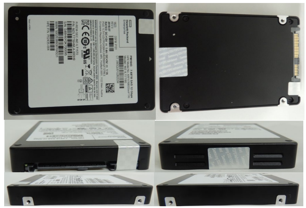
<u>Exhibit 5</u> – Specification of the Samsung SAS 12G TCG Enterprise SSC SEDs PM1643 Series, MZILT7T6HMLA-000H9, Cryptographic Boundary (From top to bottom – Left to right: top side, bottom side, front side, back side, left side, and right side).