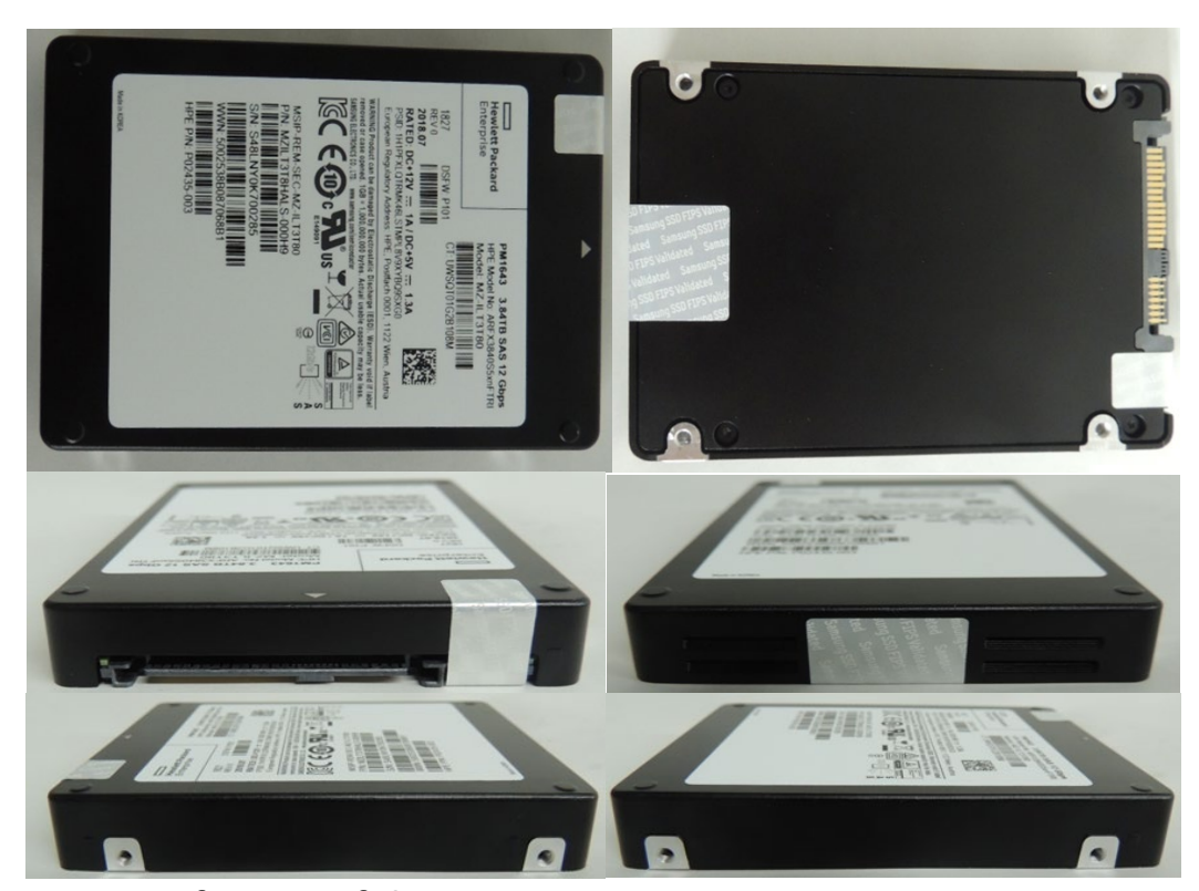
<u>Exhibit 4</u> – Specification of the Samsung SAS 12G TCG Enterprise SSC SEDs PM1643 Series, MZILT3T8HALS-000H9, Cryptographic Boundary (From top to bottom – Left to right: top side, bottom side, front side, back side, left side, and right side).