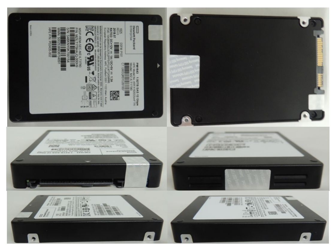
<u>Exhibit 3</u> – Specification of the Samsung SAS 12G TCG Enterprise SSC SEDs PM1643 Series, MZILT1T9HAJQ-000H9, Cryptographic Boundary (From top to bottom – Left to right: top side, bottom side, front side, back side, left side, and right side).