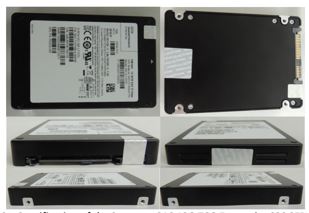
<u>Exhibit 6</u> – Specification of the Samsung SAS 12G TCG Enterprise SSC SEDs PM1643 Series, MZILT15THMLA-000H9, Cryptographic Boundary (From top to bottom – Left to right: top side, bottom side, front side, back side, left side, and right side).