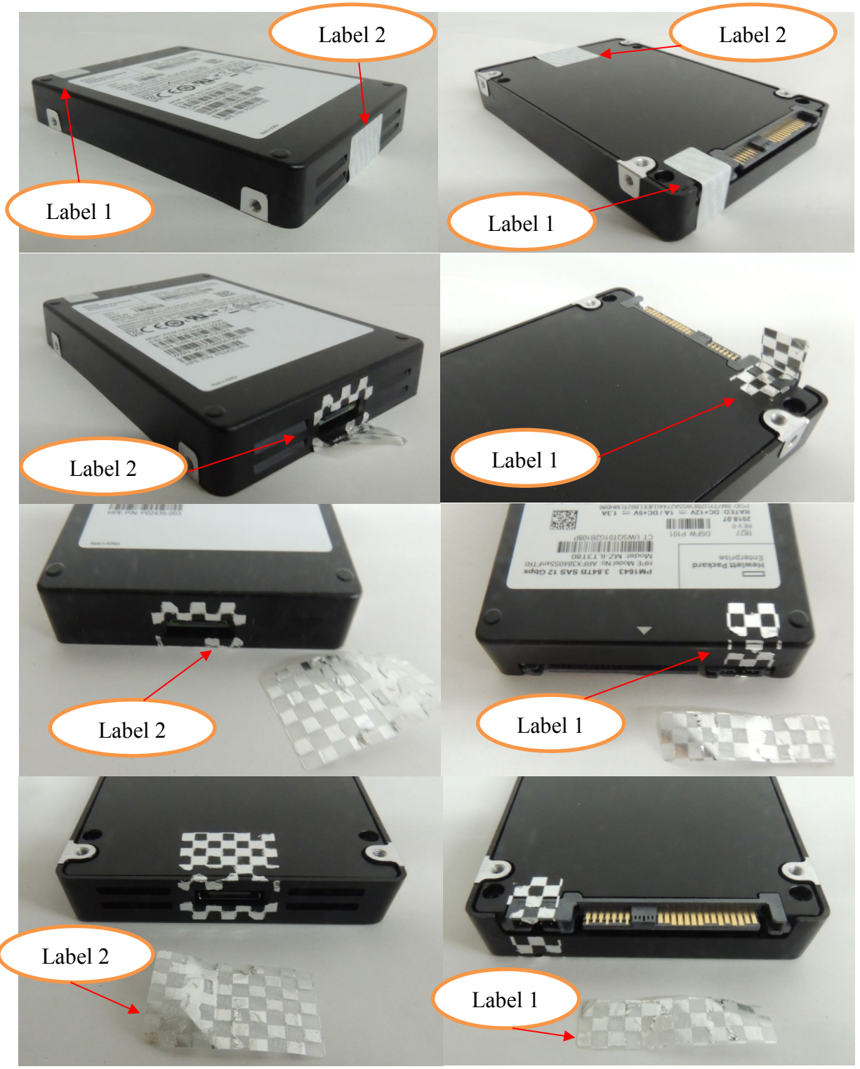
Exhibit 20 – Signs of Tamper