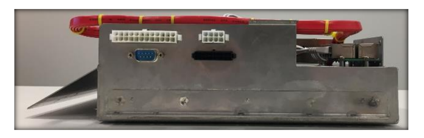
Figure 5. Right Side of the Secure Execution Environment (SEE) Loader