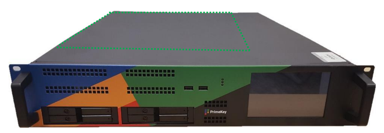
Figure 1 - PrimeKey SEE Appliance

The SEE Loader module is a multi-chip embedded hardware cryptographic module residing within a PrimeKey SEE appliance (note: the appliance is not included in the scope of the SEE Loader validation). The cryptographic boundary of the module is defined to encompass all components inside of the metal shielding/walls and hard epoxy resin potting material shown in Figures 2, 3, 4 and 5. The Figure below shows the positioning of the SEE Loader module in its host PrimeKey SEE appliance.