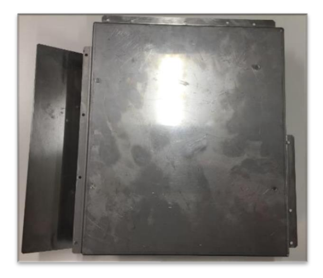
Figure 7. Bottom View of the Secure Execution Environment (SEE) Loader