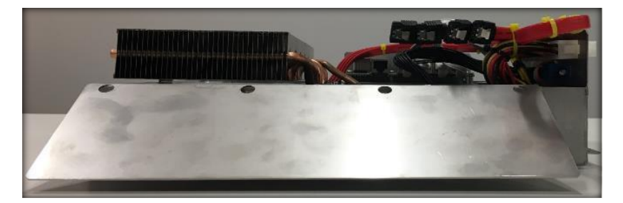
Figure 2. Front of the Secure Execution Environment (SEE) Loader

As shown in the Figures below, the module is entirely encapsulated in potting material and the sides and bottom are also protected by a metal walls which obscures visibility to all the electronic components.