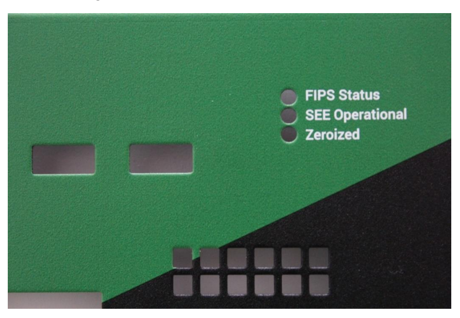
Figure 9 - Status LEDs on the PrimeKey Appliance

The five (5) LED status lines from the module connect to three (3) LEDs located on the front panel of the host appliance as shown in Figure 8 below: