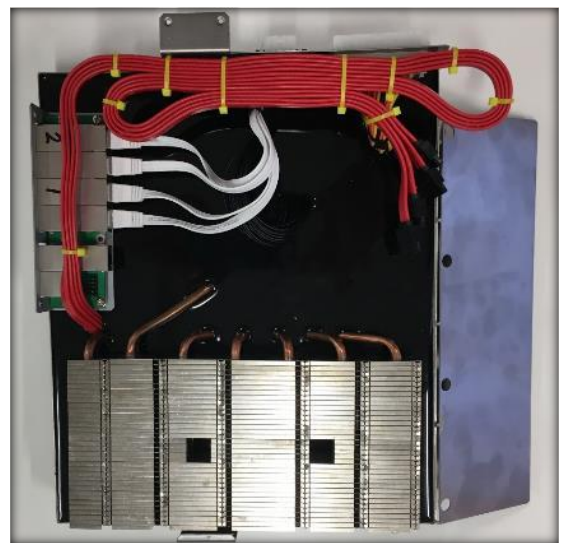
Figure 6. Top View of the Secure Execution Environment (SEE) Loader