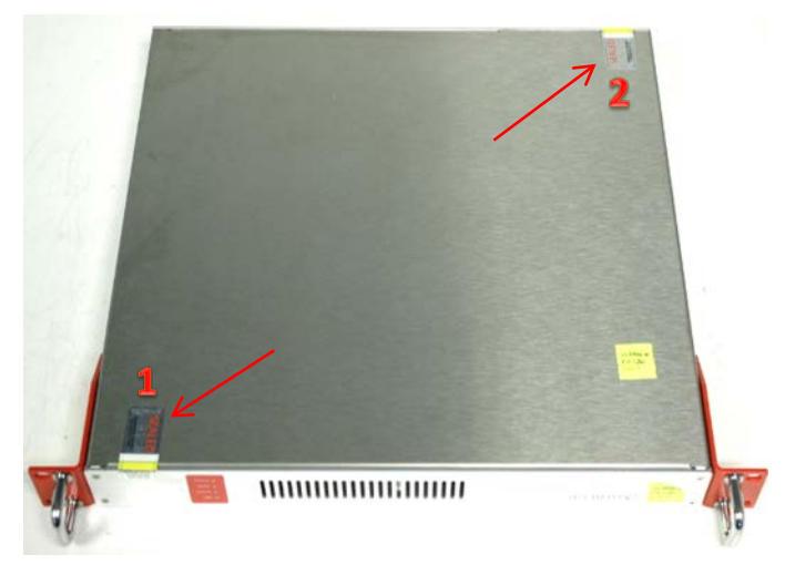
Figure 5: E Variant Tamper-Evident Seal Locations (Top, Back) (Red Arrows)