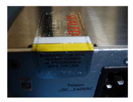
Figure 7: Tamper-evident label (2) E-Module back