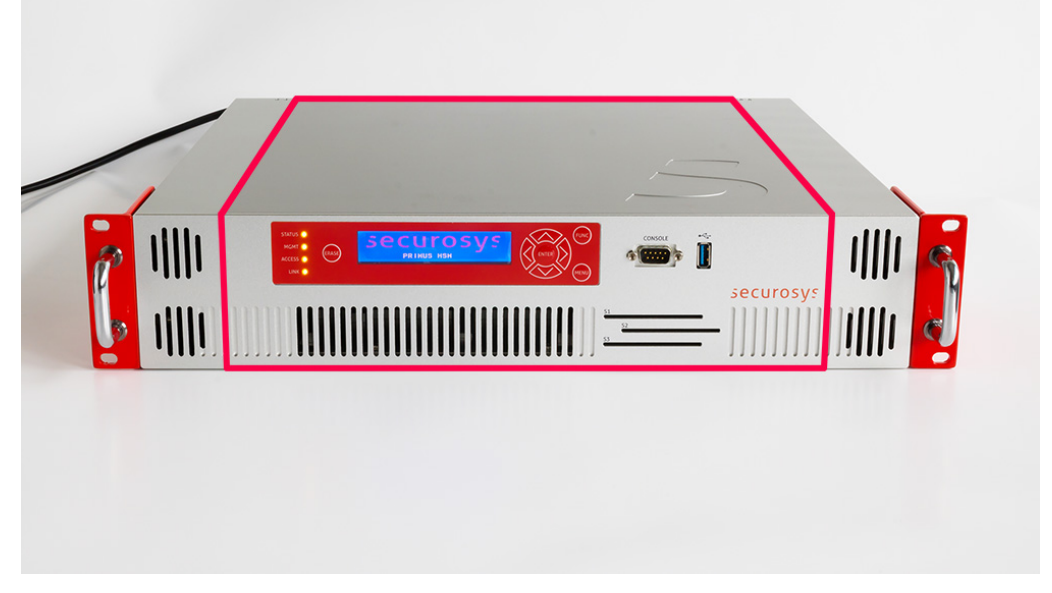
Figure 3: X-Module Front with cryptographic boundary in red