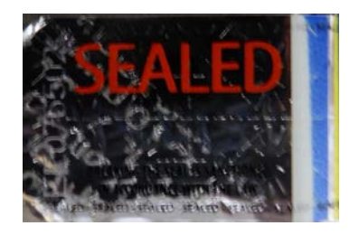
Figure 10: Tamper-evident label showing signs of tamper ("void" imprint, blue color strip from heat)

In these cases carefully check the device according to the "Physical Security Inspection Guidelines" as this may indicate an attempted intrusion.