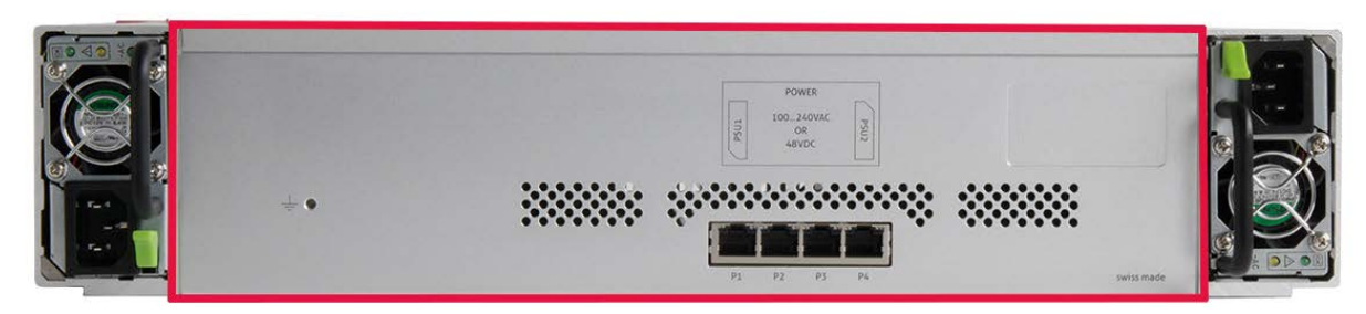
Figure 4: X-Module back with cryptographic boundary in red