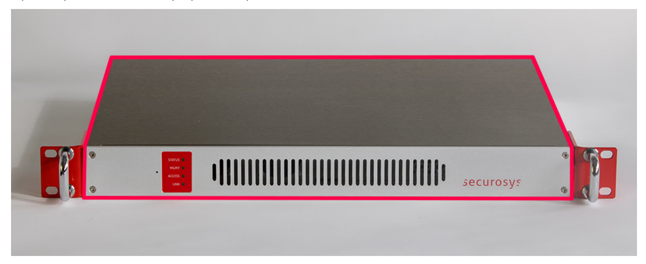
Figure 1: E-Module Front with cryptographic boundary in red

The physical forms of the Module are depicted in the following Figures. The boundary of the module includes the chassis and everything within. However, this does not include the removable power supplies on the X-Module – they are outside the boundary and may be removed, replaced, etc. The X-Module also relies on Smart Cards as external input/output devices, for the purposes of operator authentication.