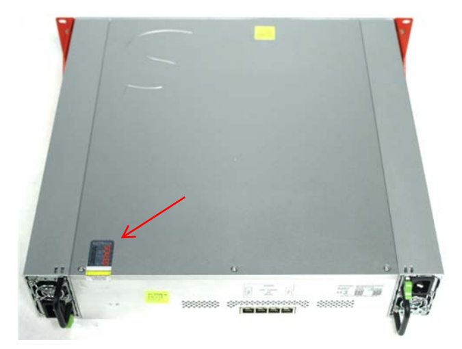
Figure 8: X Variant Tamper-Evident Seal Location (Top, Back) (Red Arrow)