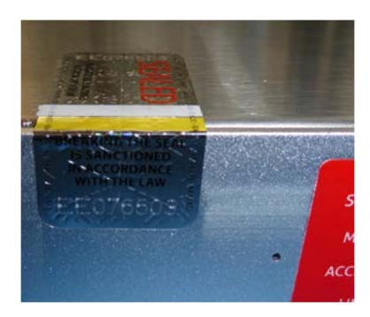
Figure 6: Tamper-evident label (1) E-Module front