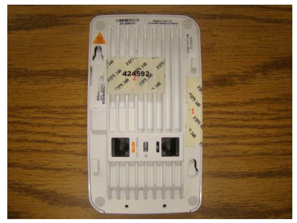
Figure 7 – AP-205H Bottom View