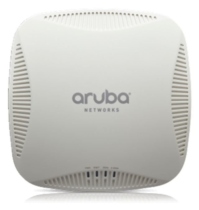
Figure 2: Aruba AP-205

This section introduces the Aruba AP-205 Wireless Access Point (AP) with FIPS 140-2 Level 2 validation. It describes the purpose of the AP, its physical attributes, and its interfaces.