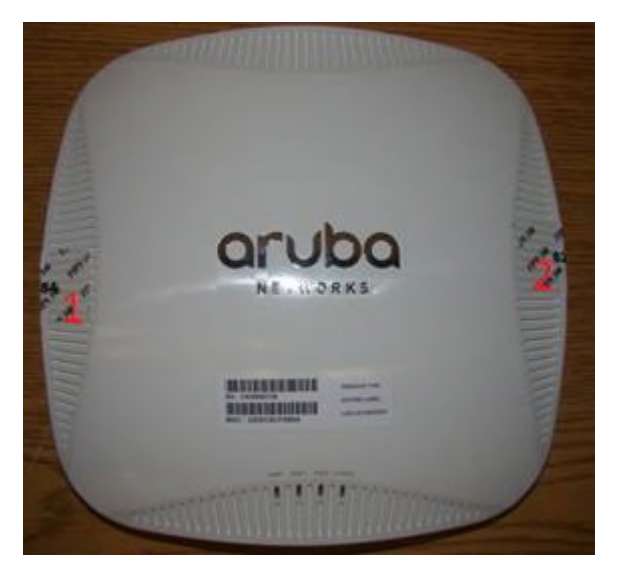
Figure 3 - AP-204/205 Top View