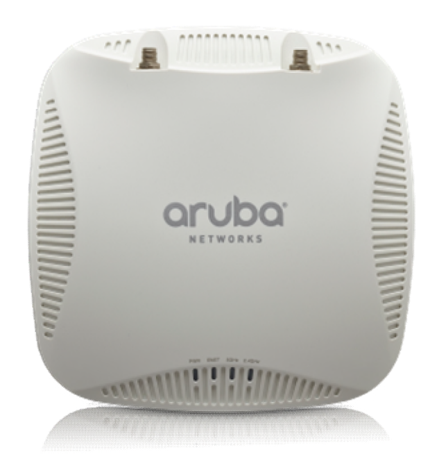
Figure 1: Aruba AP-204

This section introduces the Aruba AP-204 Wireless Access Point (AP) with FIPS 140-2 Level 2 validation. It describes the purpose of the AP, its physical attributes, and its interfaces.