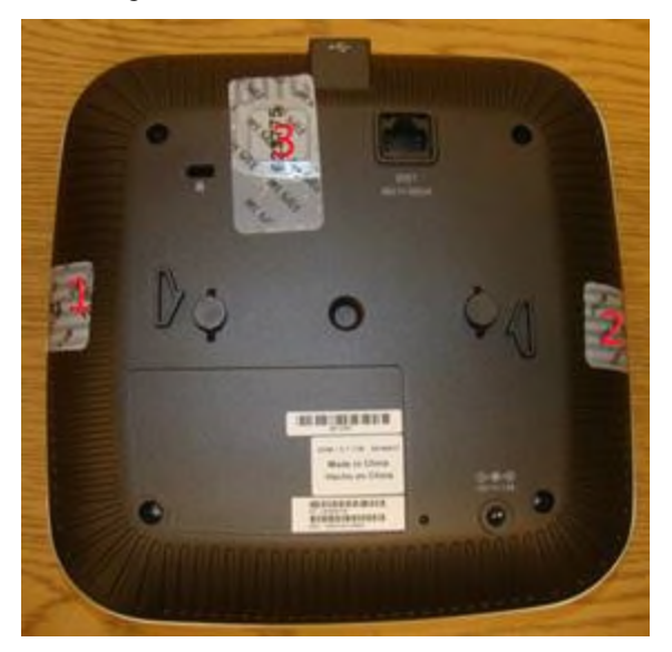
Figure 6 – AP-204/205 Bottom View