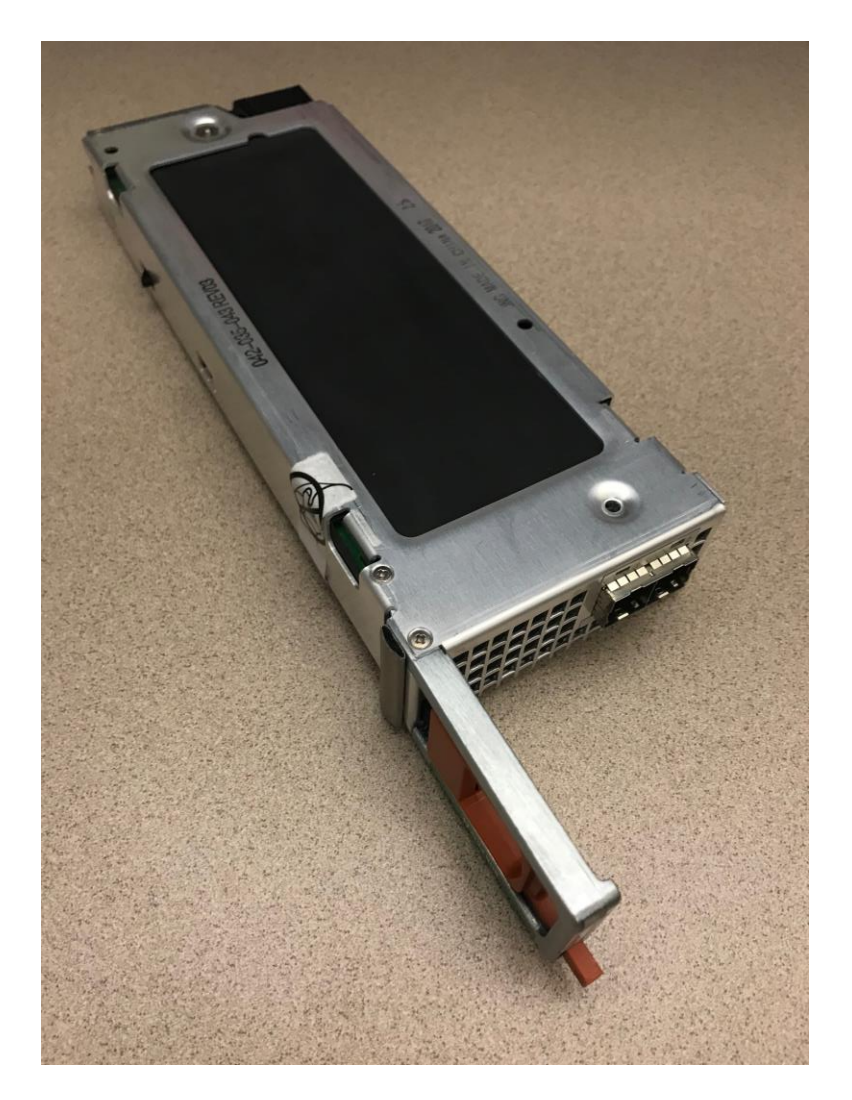
Figure 4 – [B] Physical Boundary (Bottom)

No components are excluded from validation. The module encrypts and decrypts data using only a FIPS-approved mode of operation. It does not have any functional non-approved modes or bypass capability.