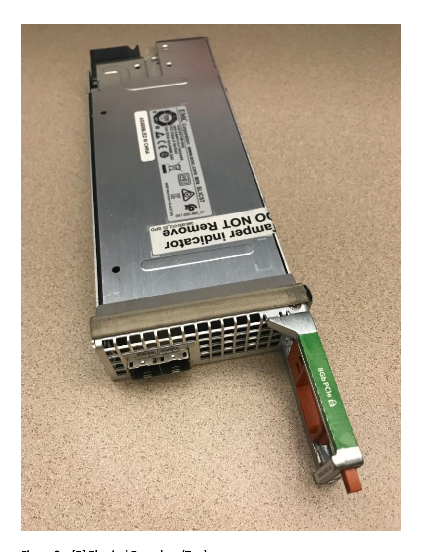
Figure 3 – [B] Physical Boundary (Top)