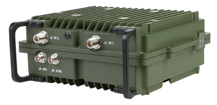
Figure 1 – Harris RF-7800W Integrated Radio/PA

The lightweight RF-7800W is easy to configure and deploy. Using a standard Web browser, an operator has access to all required configuration items and statistics necessary to configure and monitor the operation of the radio. Third-party network management applications can also be utilized via the standard Simple Network Management Protocol (SNMP) interface. Although SNMPv3 can support AES encryption in CFB mode the module firmware has been designed to block the ability to view or alter critical security parameters (CSPs) through this interface. Also note that the SNMPv3 interface is a management interface for the Harris devices and that no CSPs or user data are transmitted over this interface.