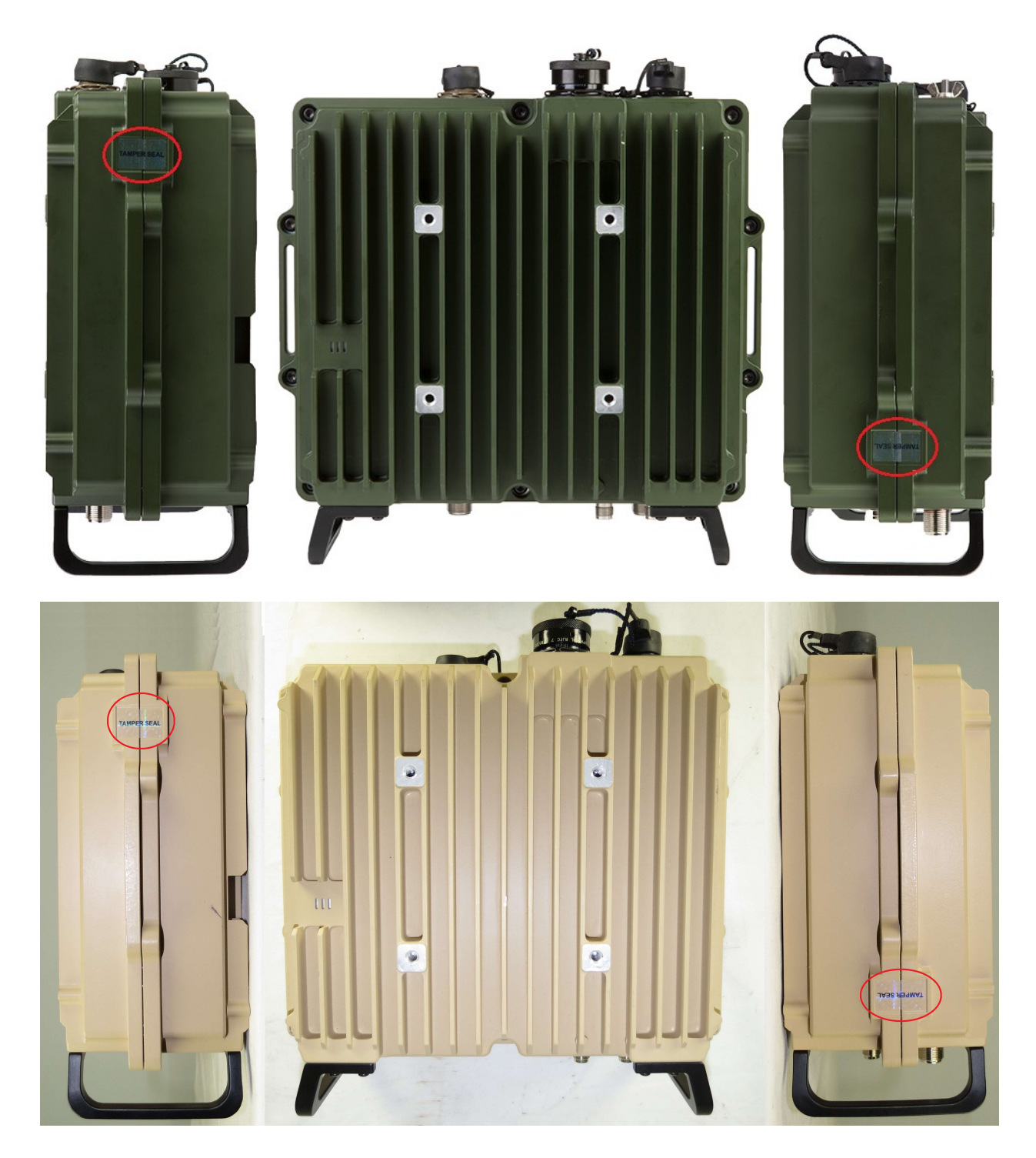
Figure 3 – Tamper-Evident Label Locations for RF-7800W