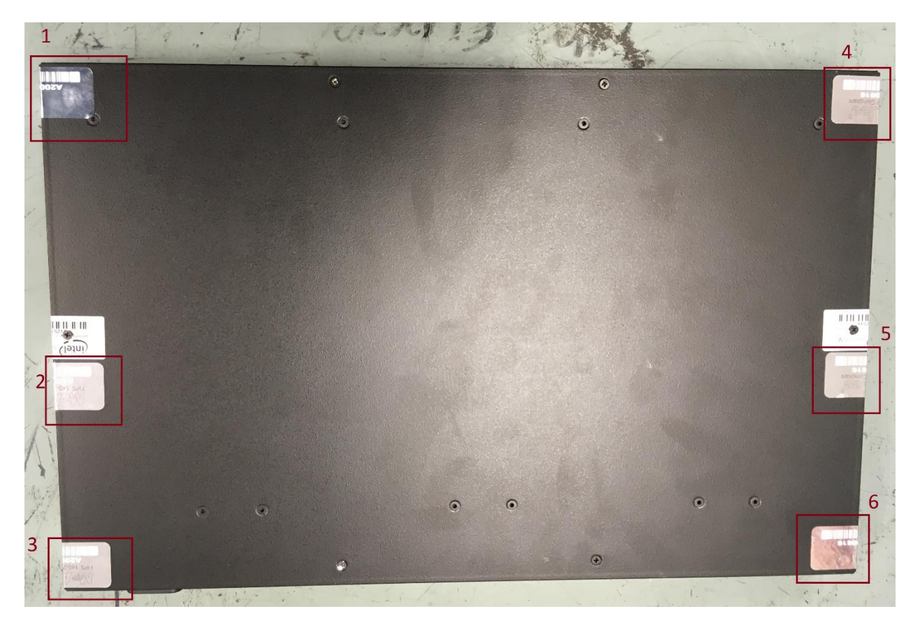
Figure 7 – Tamper Label Placement (NS3100/NS3200 Sensors)

Figure 7 depicts the tamper label locations on the cryptographic module for the NS3100/NS3200 platforms. There are 6 tamper labels and they are numbered in red. An example tamper label is shown in Figure 9.