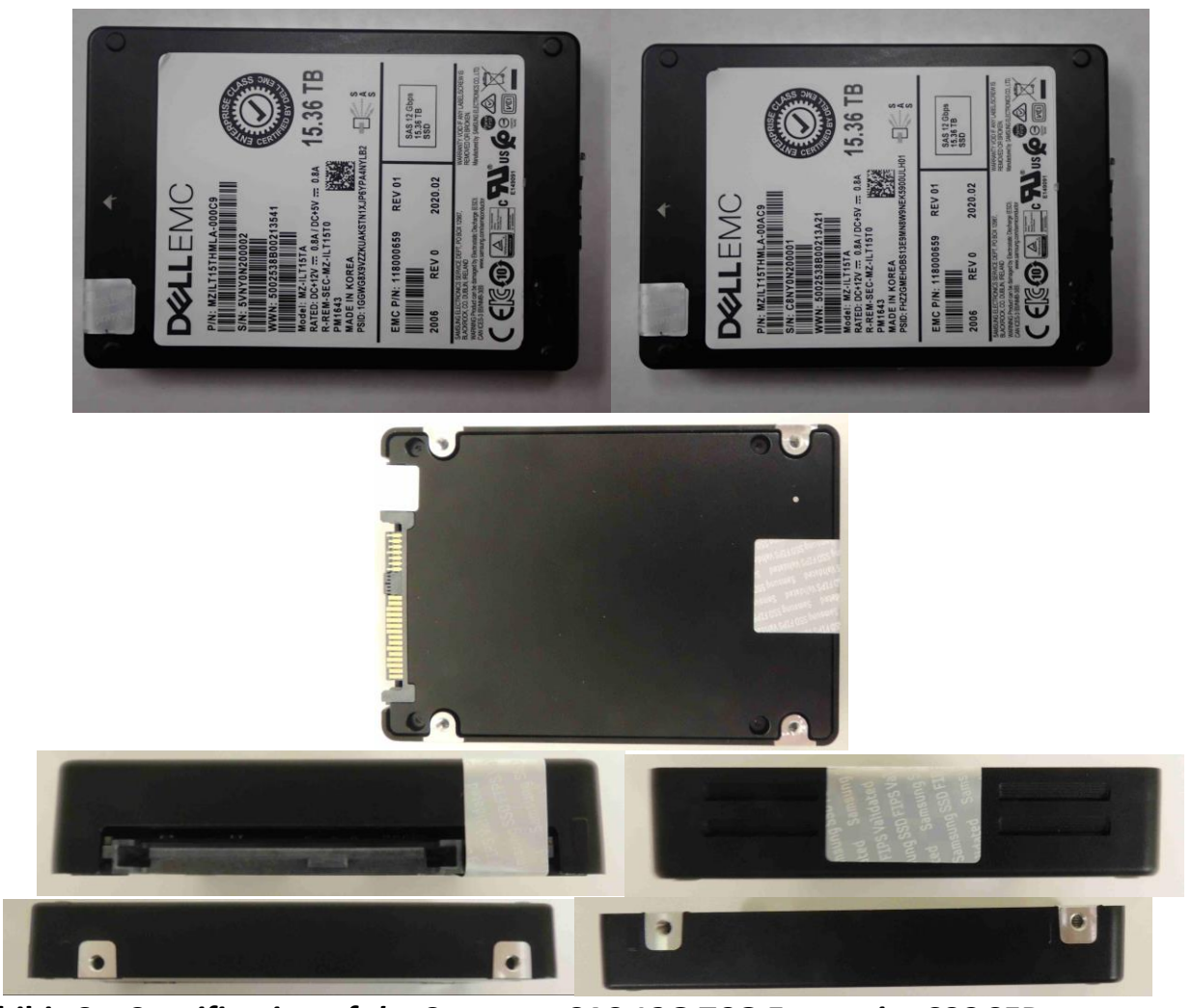
<u>Exhibit 6</u> – Specification of the Samsung SAS 12G TCG Enterprise SSC SEDs PM1643/PM1645 Series, MZILT15THMLA-000C9, MZILT15THMLA-00AC9 Cryptographic Boundary (From top to bottom – Left to right: top side, bottom side, front side, back side, left side, and right side).