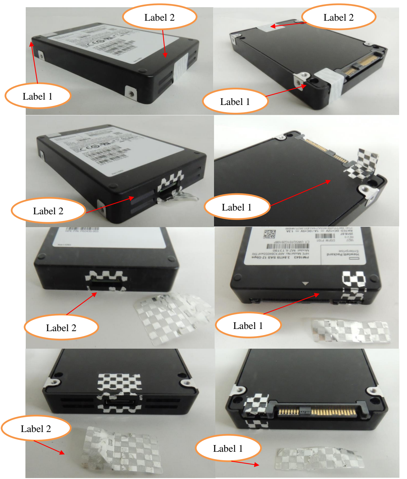
Exhibit 24 – Signs of Tamper