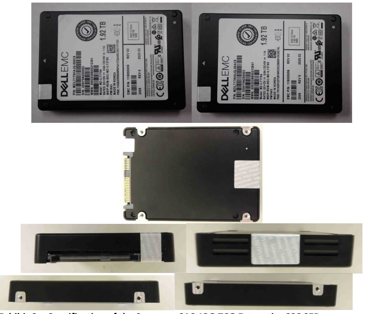
Exhibit 3 – Specification of the Samsung SAS 12G TCG Enterprise SSC SEDs PM1643/PM1645 Series, MZILT1T9HAJQ-000C9, MZILT1T9HAJQ-00AC9 Cryptographic Boundary (From top to bottom – Left to right: top side, bottom side, front side, back side, left side, and right side).