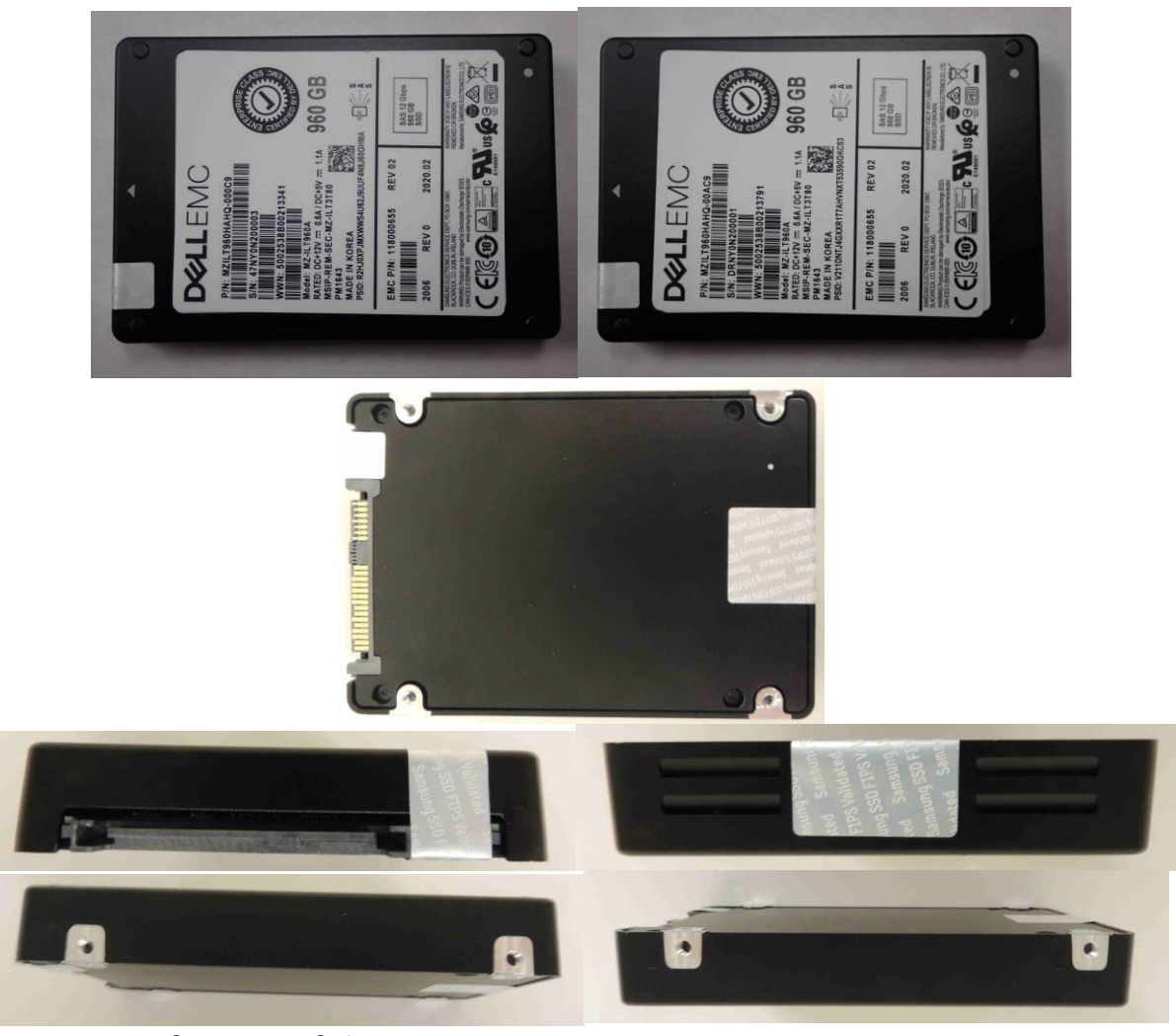
Exhibit 2 – Specification of the Samsung SAS 12G TCG Enterprise SSC SEDs PM1643/PM1645 Series, MZILT960HAHQ-000C9, MZILT960HAHQ-00AC9 Cryptographic Boundary (From top to bottom – Left to right: top side, bottom side, front side, back side, left side, and right side).

New firmware versions within the scope of this validation must be validated through the FIPS 140-2 CMVP. Any other firmware loaded into this module is out of the scope of this validation and requires a separate FIPS 140-2 validation.