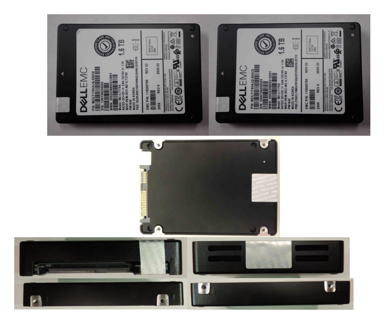
Exhibit 9 – Specification of the Samsung SAS 12G TCG Enterprise SSC SEDs PM1643/PM1645 Series, MZILT1T6HAJQ-000C9, MZILT1T6HAJQ-00AC9 Cryptographic Boundary (From top to bottom – Left to right: top side, bottom side, front side, back side, left side, and right side).