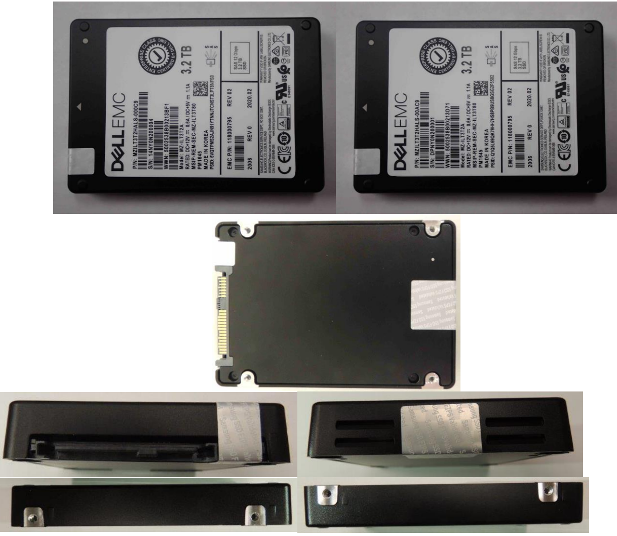
Exhibit 10 – Specification of the Samsung SAS 12G TCG Enterprise SSC SEDs PM1643/PM1645 Series, MZILT3T2HALS-000C9, MZILT3T2HALS-00AC9 Cryptographic Boundary (From top to bottom – Left to right: top side, bottom side, front side, back side, left side, and right side).