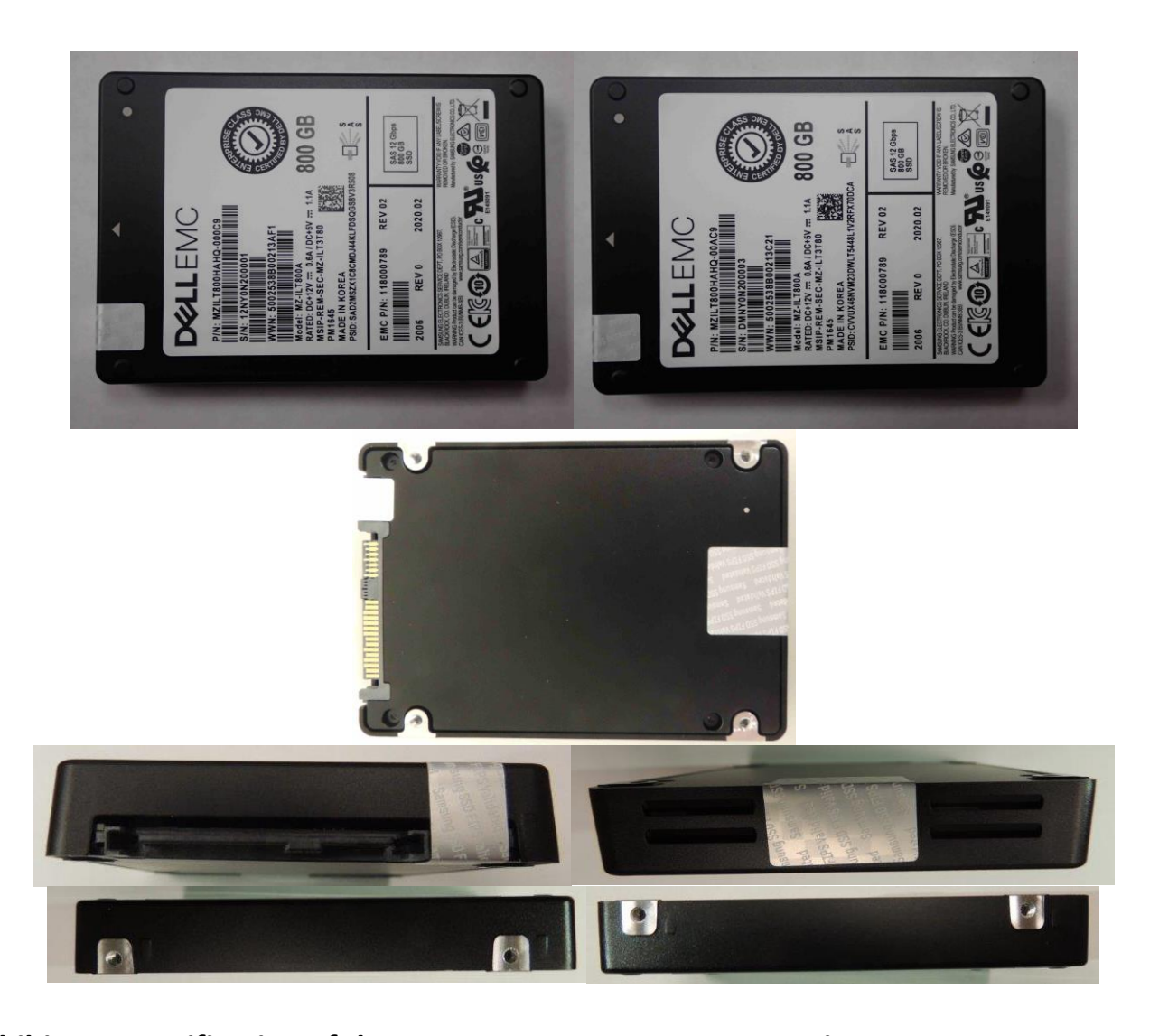
Exhibit 8 – Specification of the Samsung SAS 12G TCG Enterprise SSC SEDs PM1643/PM1645 Series, MZILT800HAHQ-000C9, MZILT800HAHQ-00AC9 Cryptographic Boundary (From top to bottom – Left to right: top side, bottom side, front side, back side, left side, and right side).