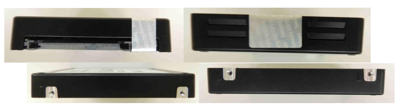
Exhibit 4 – Specification of the Samsung SAS 12G TCG Enterprise SSC SEDs PM1643/PM1645 Series, MZILT3T8HALS-000C9, MZILT3T8HALS-00AC9 Cryptographic Boundary (From top to bottom – Left to right: top side, bottom side, front side, back side, left side, and right side).