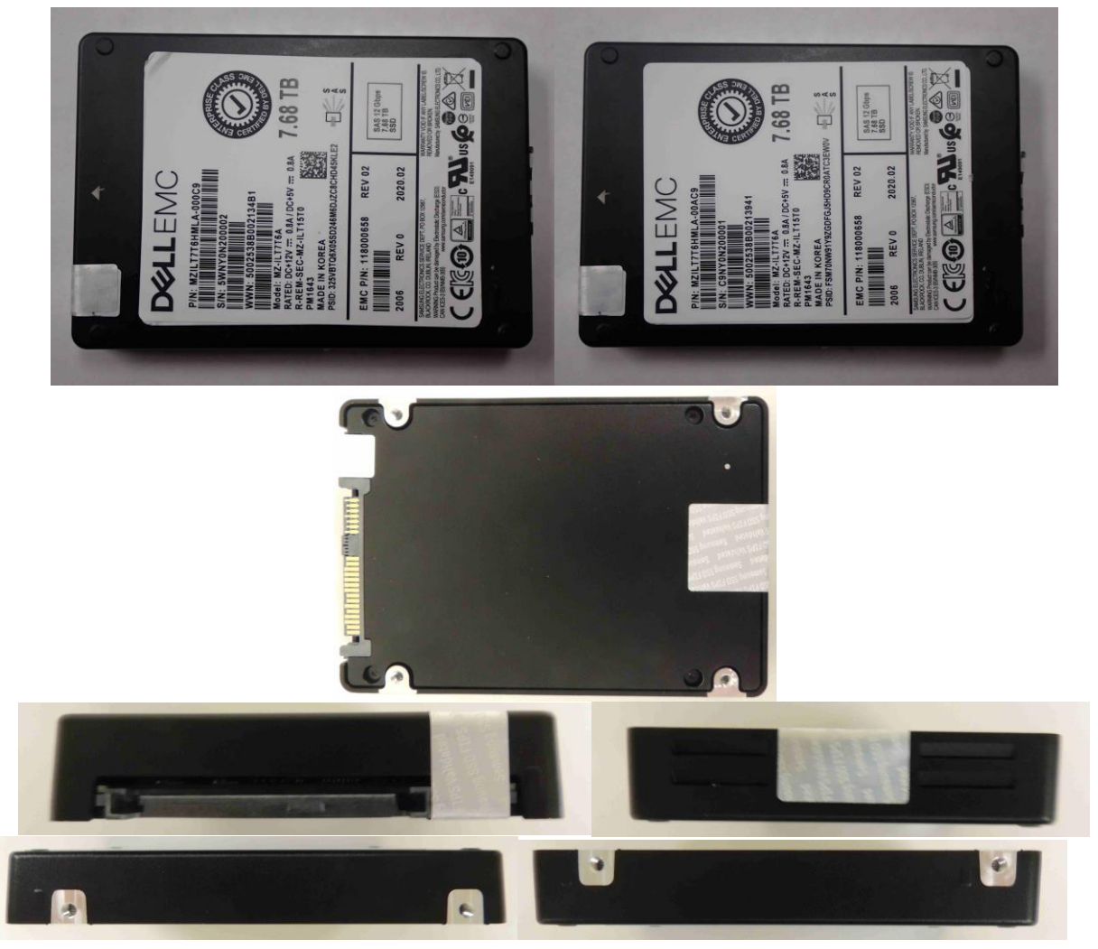
<u>Exhibit 5</u> – Specification of the Samsung SAS 12G TCG Enterprise SSC SEDs PM1643/PM1645 Series, MZILT7T6HMLA-000C9, MZILT7T6HMLA-00AC9 Cryptographic Boundary (From top to bottom – Left to right: top side, bottom side, front side, back side, left side, and right side).