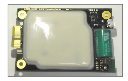
Figure: 1 Postal NRevenector US 2018

FP InovoLabs GmbH is a wholly-owned subsidiary of Francotyp-Postalia Holding AG (FP), one of the leading global suppliers of mail center solutions. A major component of FP's business is the production and support of postal franking machines (postage meters). FP InovoLabs GmbH is responsible for developing these postal franking machines for FP.