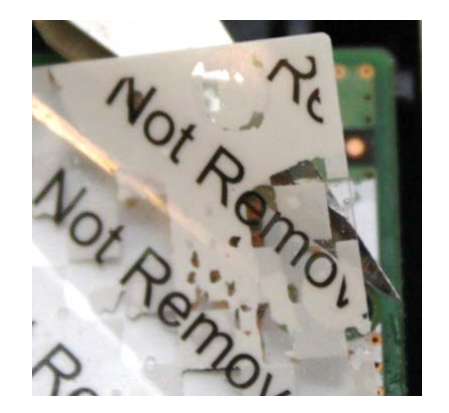
Figure 3: Tamper Evidence on Tamper Seal