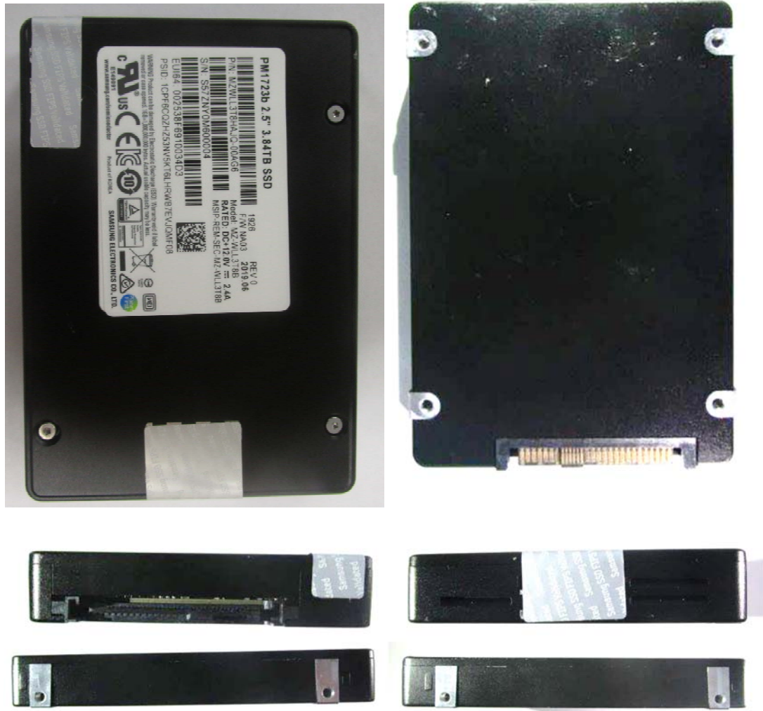
Exhibit 3 – Specification of the Samsung NVMe TCG Opal SSC SEDs PM1723b Series (MZWLL3T8HAJQ-00AG6) Cryptographic Boundary (From top to bottom – Left to right: top side, bottom side, front side, back side, left side, and right side).