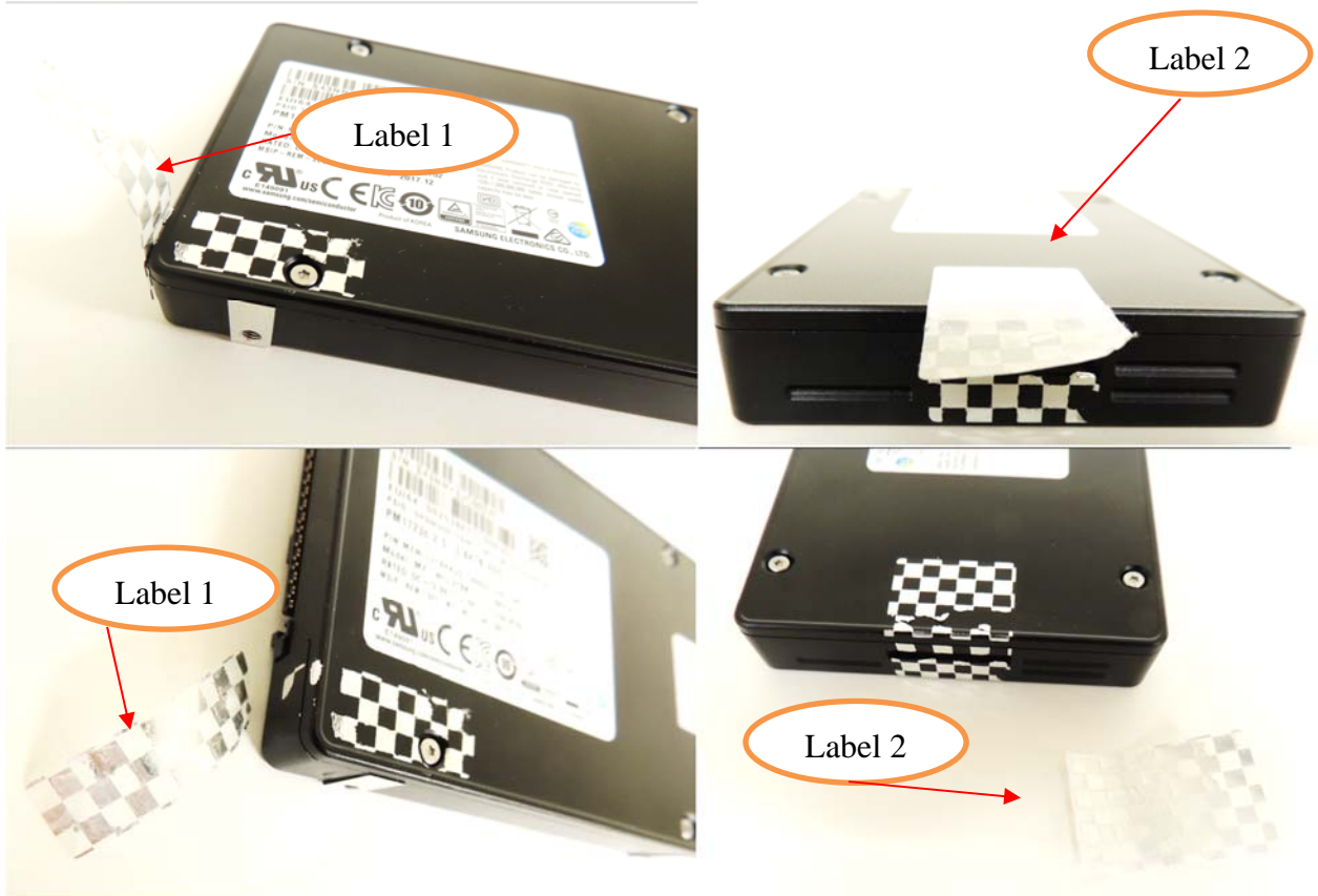
Exhibit 19 – Example Signs of Tamper

NOTE 3: Samsung Electronics Co., Ltd has excluded the following components as per AS01.09: