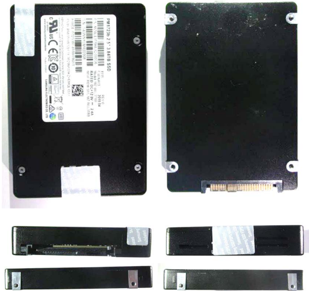
Exhibit 2 – Specification of the Samsung NVMe TCG Opal SSC SEDs PM1723b Series (MZWLL3T8HAJQ-000G6) Cryptographic Boundary (From top to bottom – Left to right: top side, bottom side, front side, back side, left side, and right side).

The following photographs show the cryptographic module's top and bottom views. The multiple-chip standalone cryptographic module consists of hardware and firmware components that are all enclosed in two aluminum alloy cases, which serve as the cryptographic boundary of the module. The top and bottom cases are assembled by screws and the tamper-evident labels are applied for the detection of any opening of the cases. No security relevant component can be seen within the visible spectrum through the opaque enclosure. New firmware versions within the scope of this validation must be validated through the FIPS 140-2 CMVP. Any other firmware loaded into this module is out of the scope of this validation and requires a separate FIPS 140-2 validation.