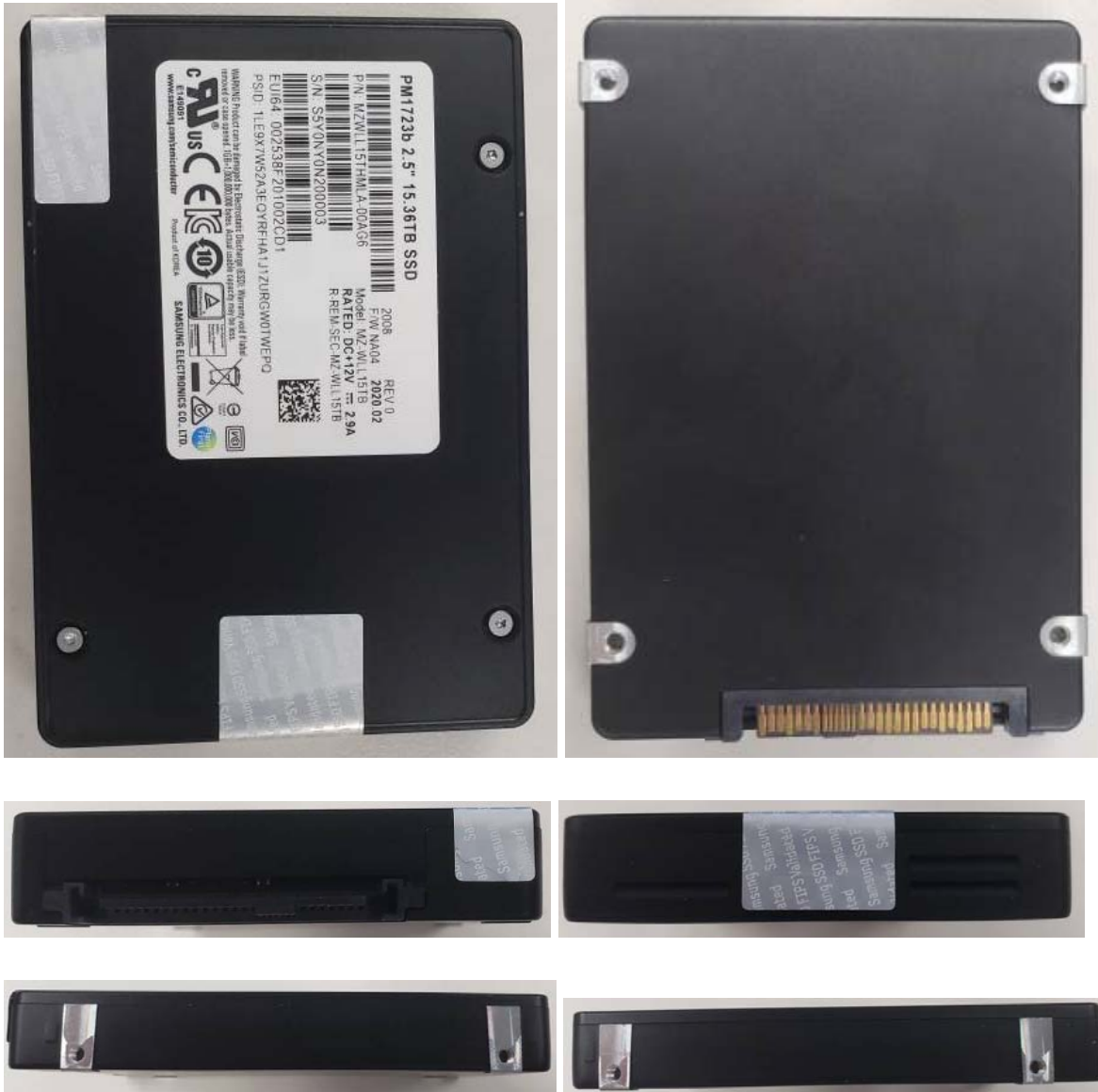
Exhibit 4 – Specification of the Samsung NVMe TCG Opal SSC SEDs PM1723b Series (MZWLL15THMLA-00AG6) Cryptographic Boundary (From top to bottom – Left to right: top side, bottom side, front side, back side, left side, and right side).