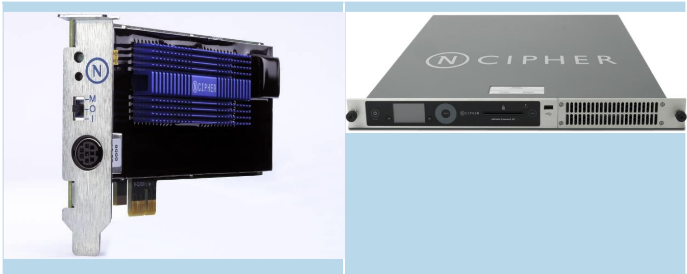
Table 2 nShield Solo (left) and nShield Connect (right)

The cryptographic boundary is delimited in red in the images in the table below. It is delimited by the heat sink and the outer edge of the potting material on the top and bottom of the PCB.