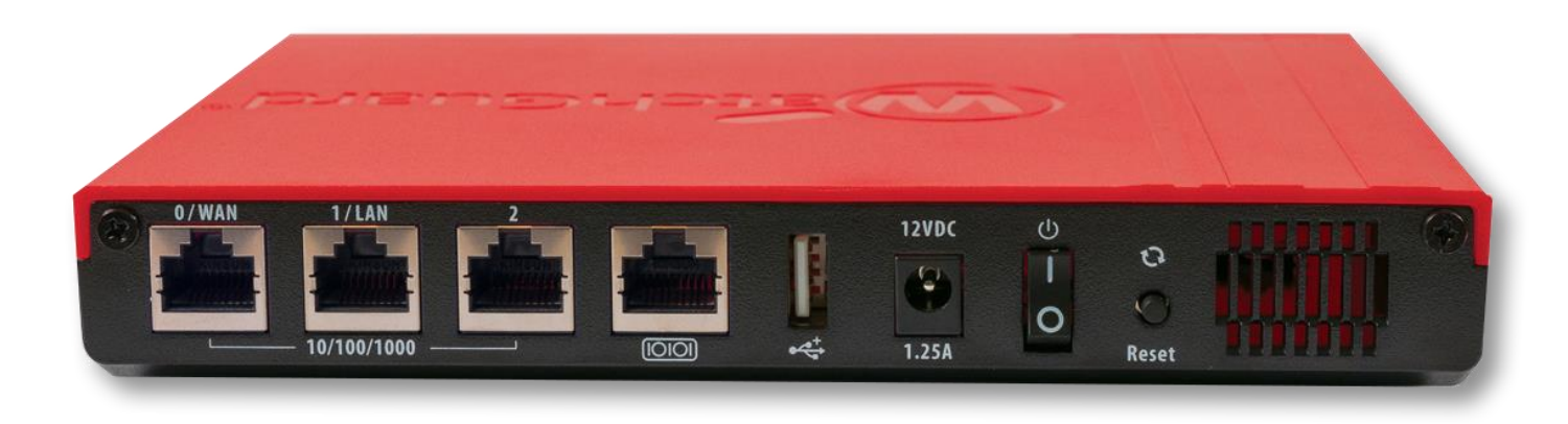
Figure 3: T15/T15-W Rear View