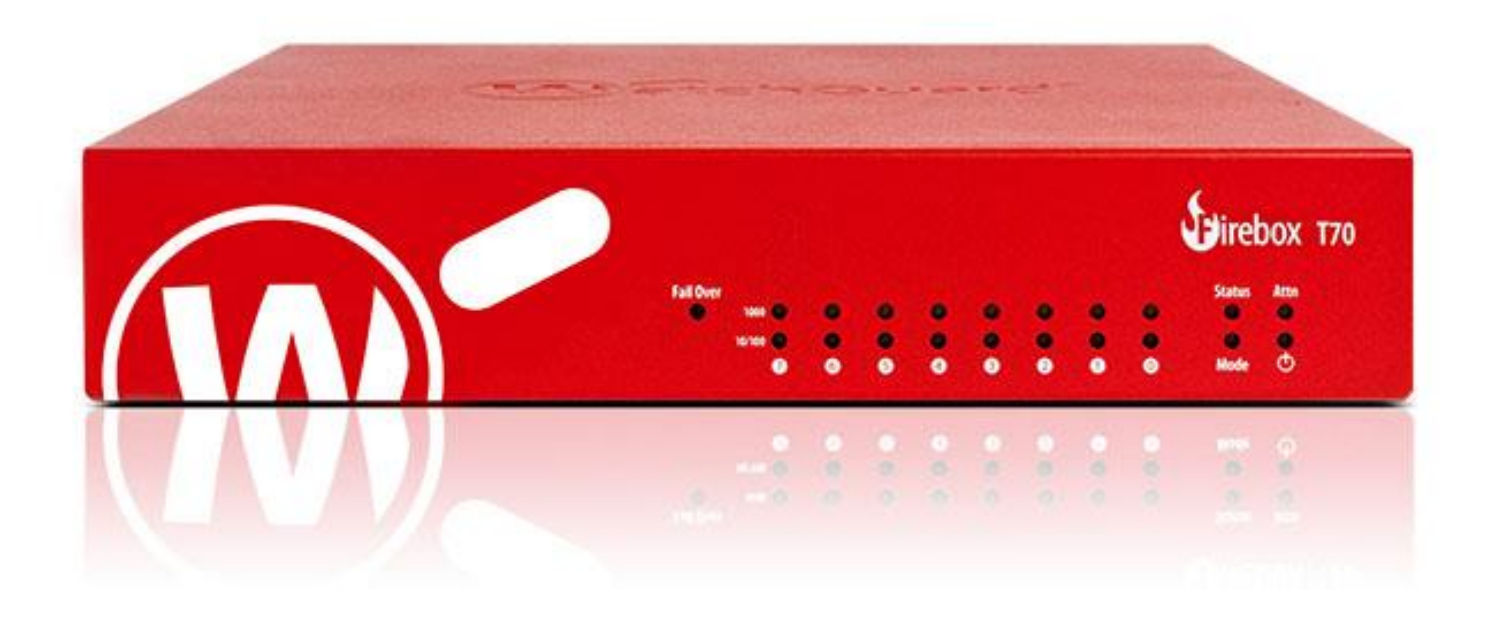
Figure 8: T70 Front View