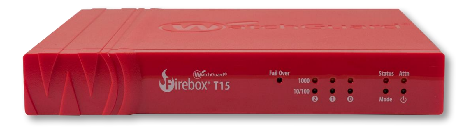
Figure 2: T15/T15-W Front View