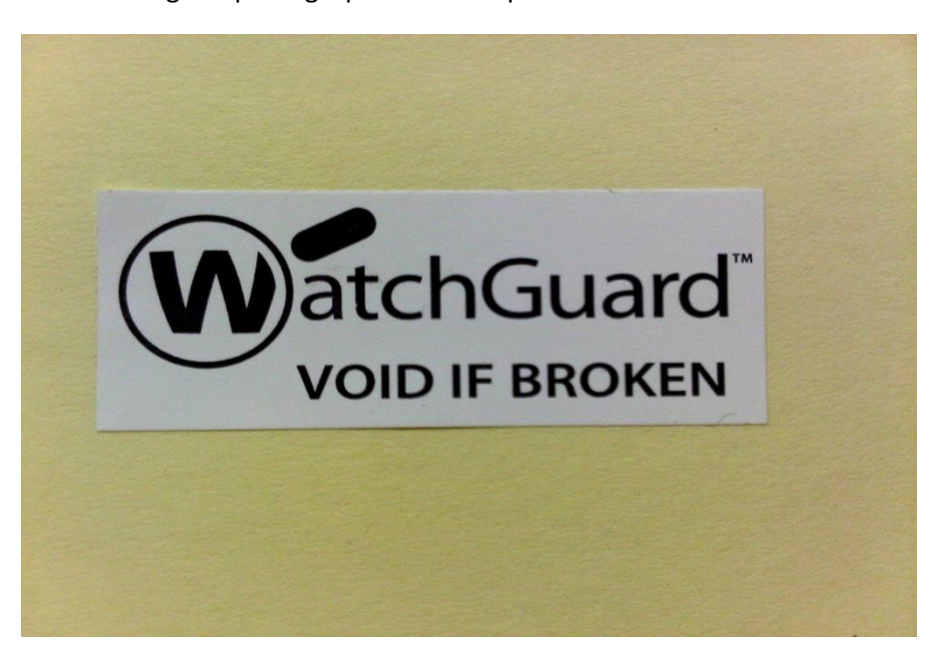
Figure 10: WatchGuard Firebox Tamper Evident Label

The following is a photograph of the tamper evident labels that are used.