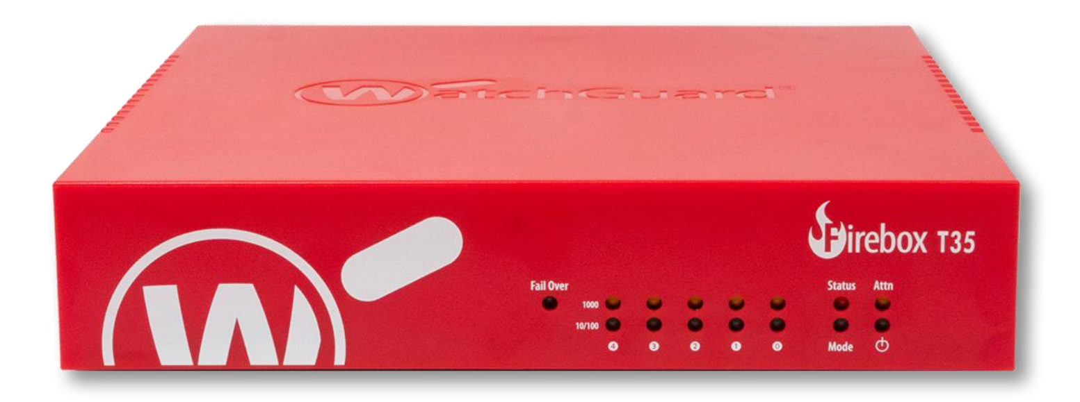
Figure 4: T35/T35-W Front View