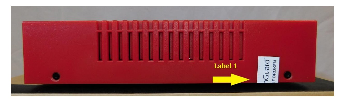
Figure 15: T55 Tamper Evident Label Placement