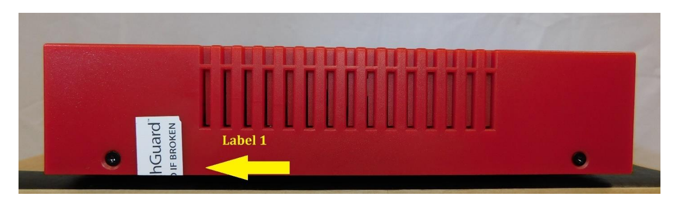
Figure 16: T55-W Tamper Evident Label Placement