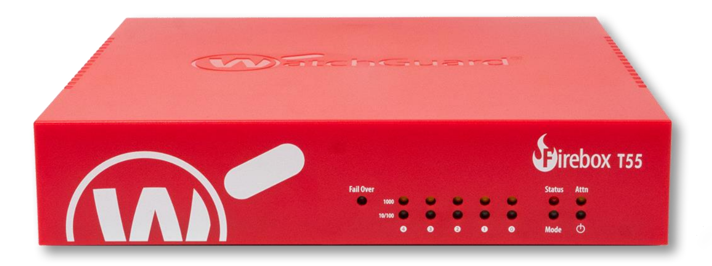
Figure 6: T55/T55-W Front View