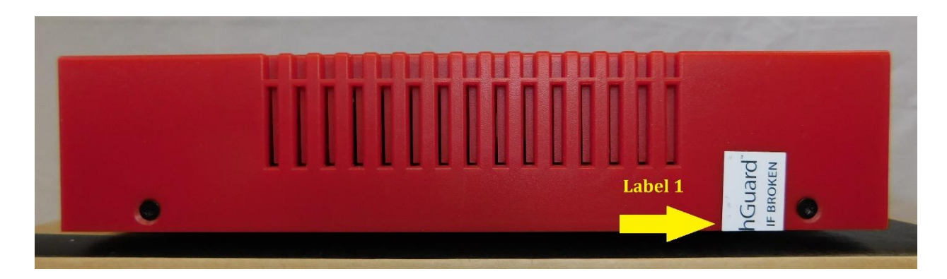
Figure 13: T35 Tamper Evident Label Placement