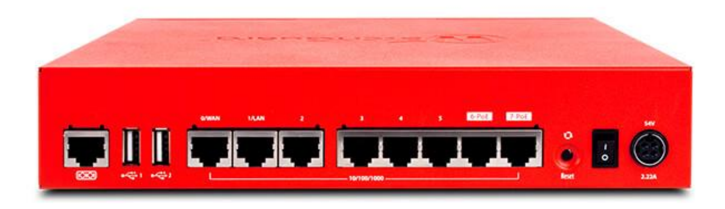
Figure 9: T70 Rear View