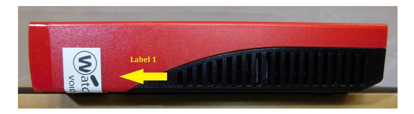
Figure 11: T15 Tamper Evident Label Placement