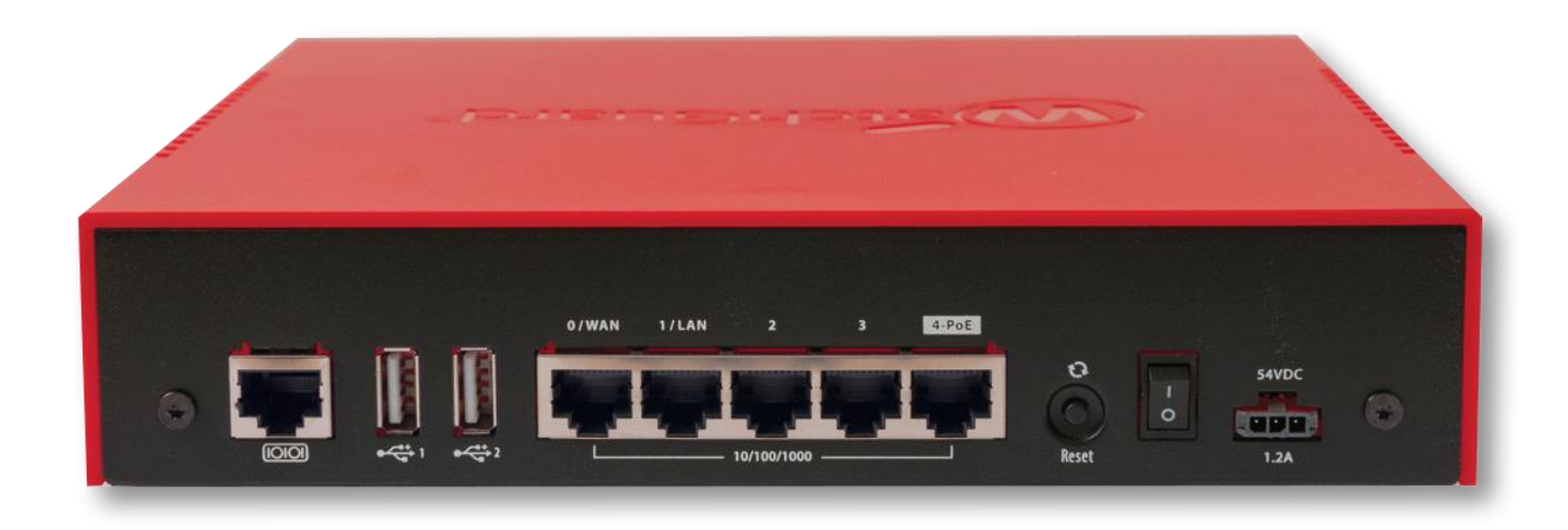
Figure 5: T35/T35-W Rear View