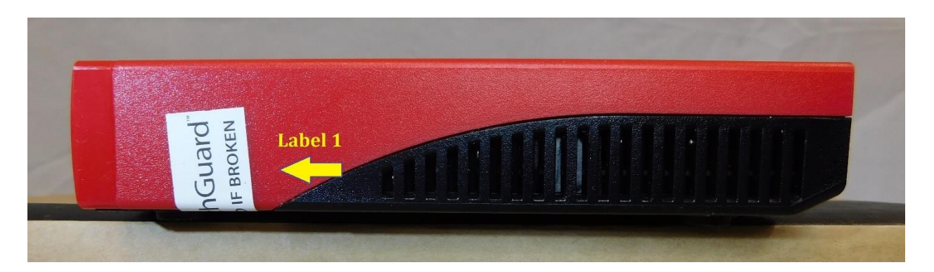
Figure 12: T15-W Tamper Evident Label Placement