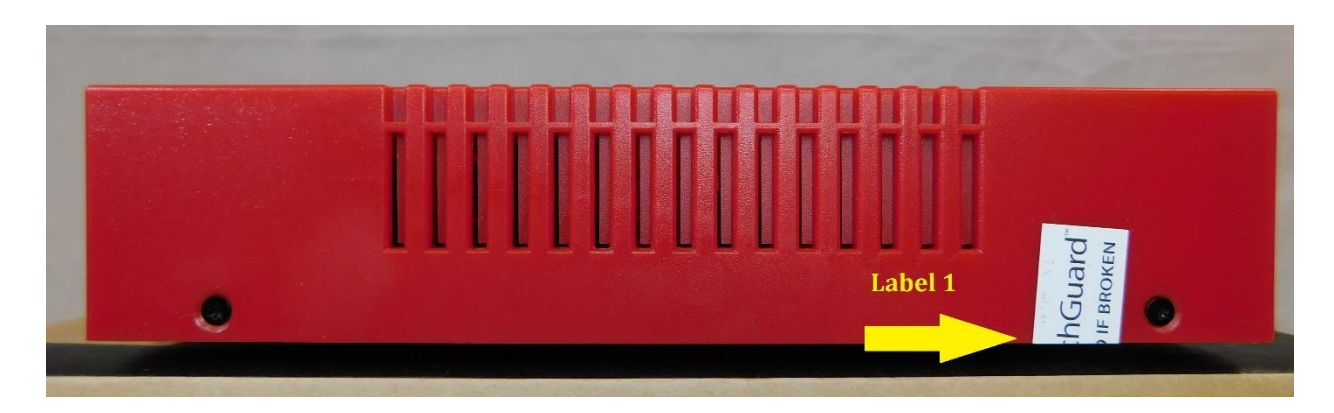
Figure 14: T35-W Tamper Evident Label Placement