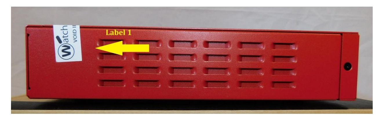
Figure 17: T70 Tamper Evident Label Placement