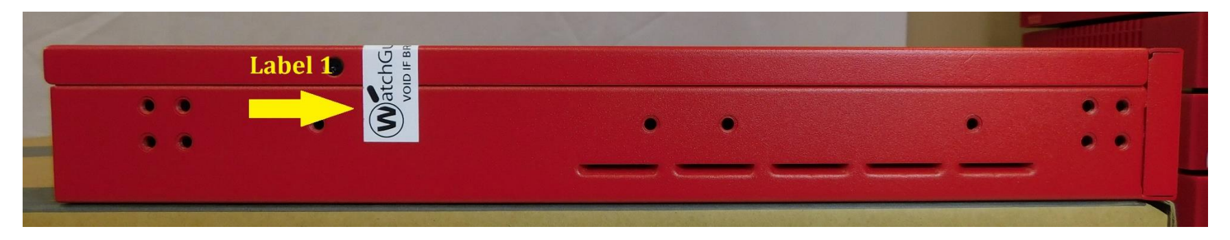
Figure 13: M470, M570, and M670 Tamper Evident Label 1 Placement