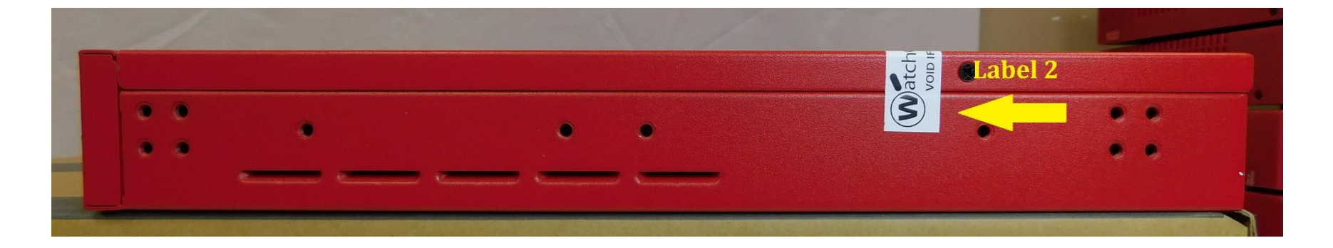
Figure 14: M470, M570, and M670 Tamper Evident Label 2 Placement