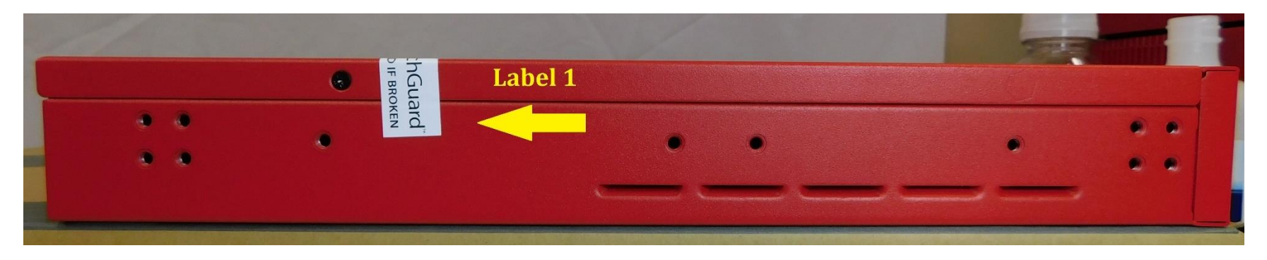
Figure 9: M270 Tamper Evident Label 1 Placement