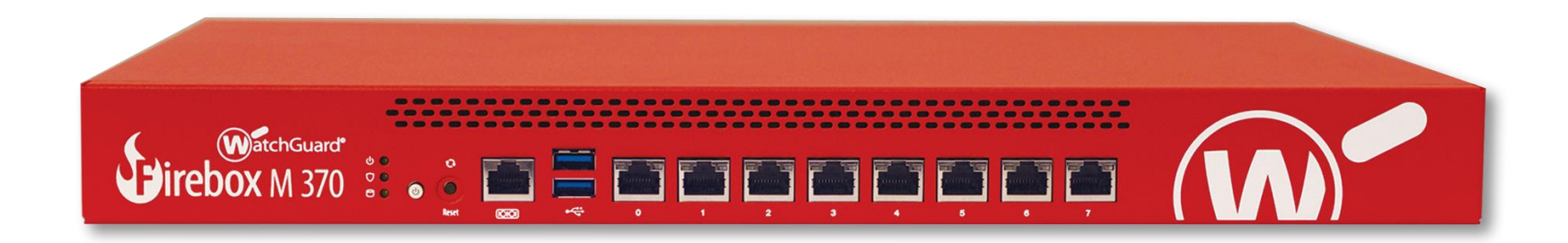
Figure 4: M370 Front View