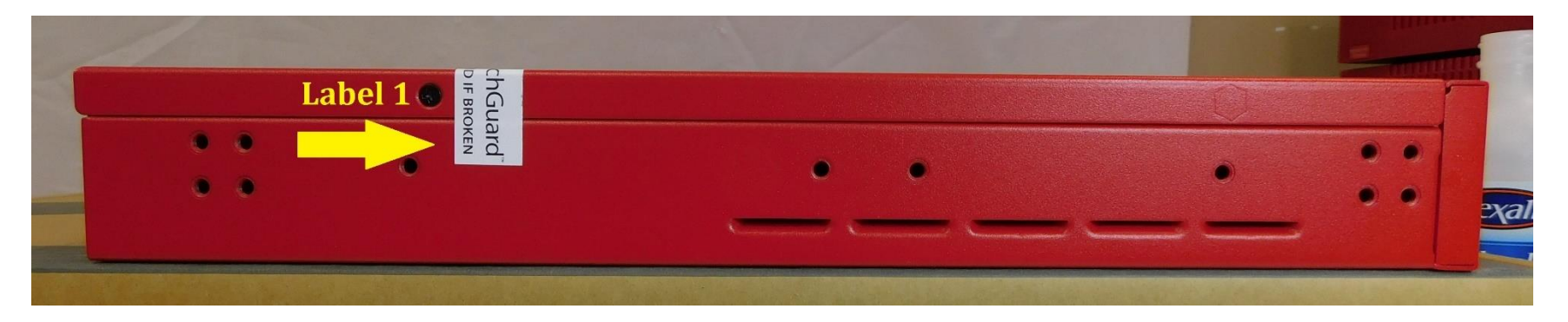
Figure 11: M370 Tamper Evident Label 1 Placement