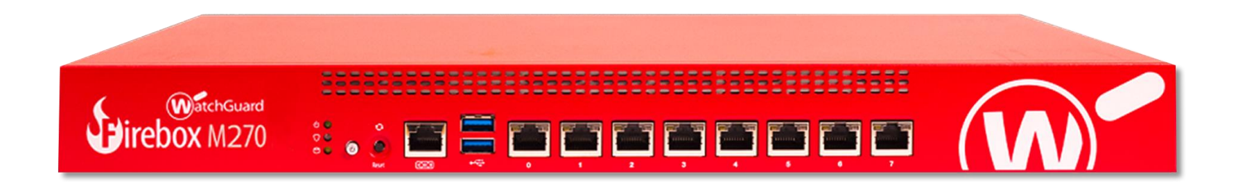
Figure 2: M270 Front View