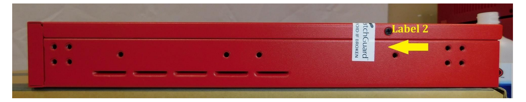
Figure 12: M370 Tamper Evident Label 2 Placement

Figure 11: M370 Tamper Evident Label 1 Placement