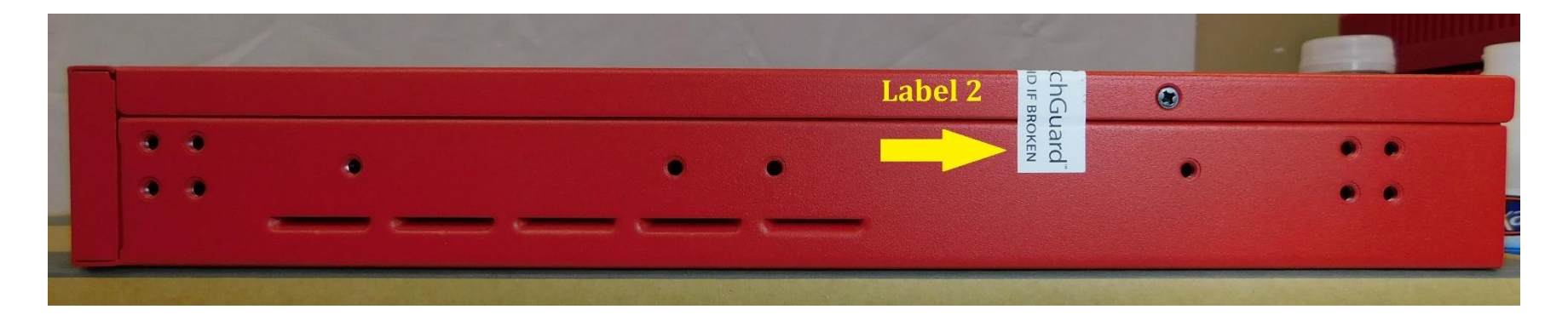
Figure 10: M270 Tamper Evident Label 2 Placement