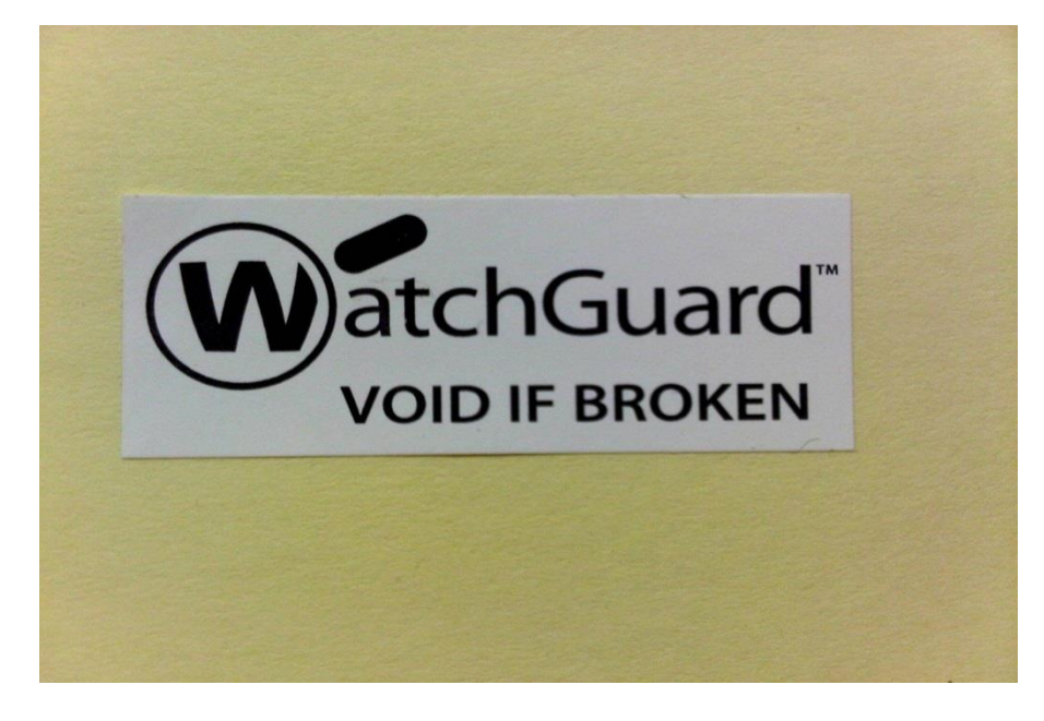
Figure 8: WatchGuard Firebox Tamper Evident Label

The following is a photograph of the tamper evident labels that are used.