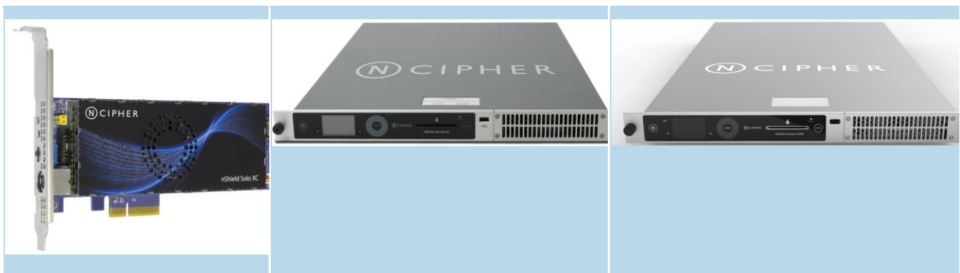
Table 2 nShield Solo XC (left), nShield Connect XC (centre), and nShield Issuance HSM (right)

The table below shows the nShield Solo XC HSM, the nShield Connect XC and the nShield Issuance HSM appliances.