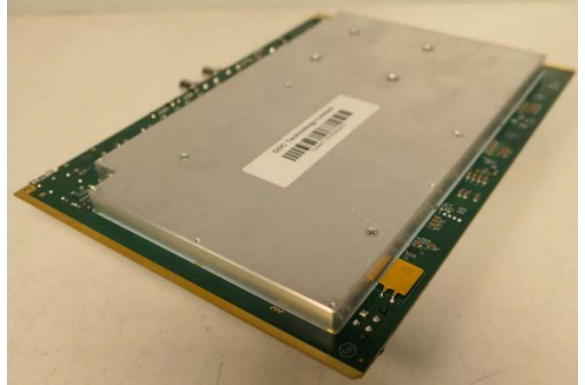
Figure 1 - Image of the GDC-IMB-v6 (Top)