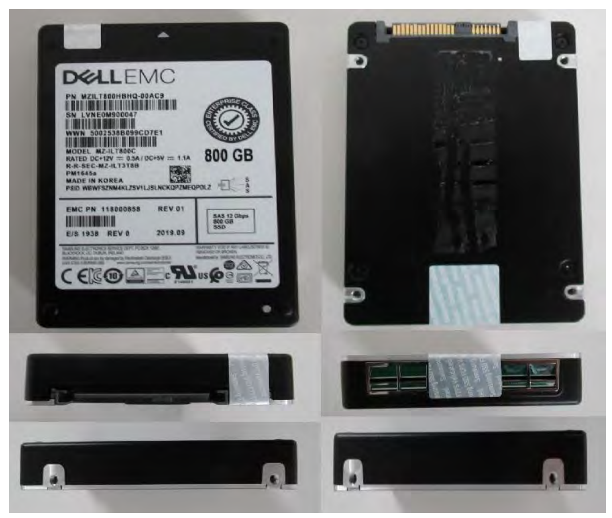
<u>Exhibit 8</u> – Specification of the Samsung SAS 12G TCG Enterprise SSC SEDs PM1643a/PM1645a Series, MZILT800HBHQ-00AC9, Cryptographic Boundary (From top to bottom – Left to right: top side, bottom side, front side, back side, left side, and right side).