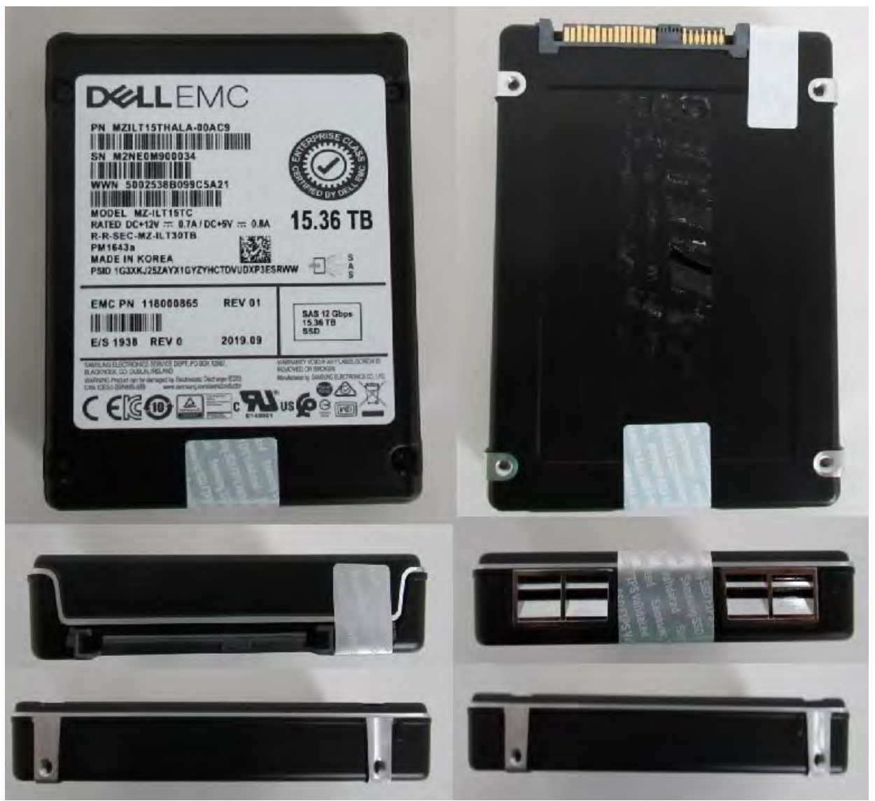
<u>Exhibit 6</u> – Specification of the Samsung SAS 12G TCG Enterprise SSC SEDs PM1643a/PM1645a Series, MZILT15THALA-00AC9, Cryptographic Boundary (From top to bottom – Left to right: top side, bottom side, front side, back side, left side, and right side).