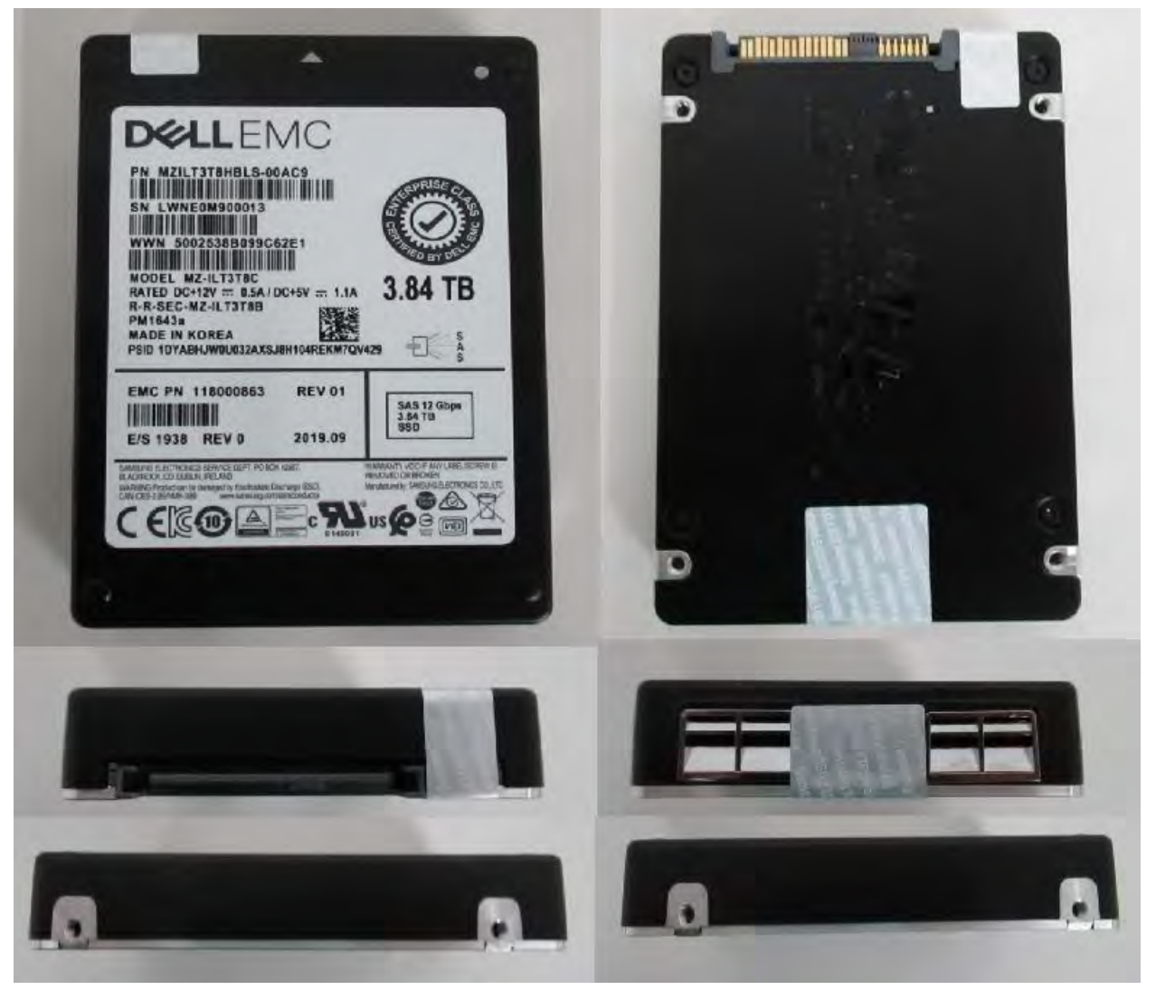
<u>Exhibit 4</u> – Specification of the Samsung SAS 12G TCG Enterprise SSC SEDs PM1643a/PM1645a Series, MZILT3T8HBLS-00AC9, Cryptographic Boundary (From top to bottom – Left to right: top side, bottom side, front side, back side, left side, and right side).