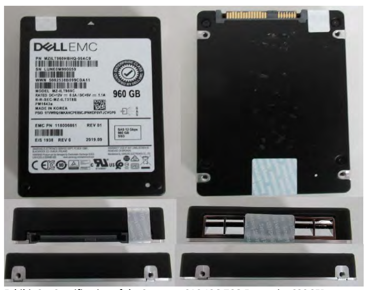
<u>Exhibit 2</u> – Specification of the Samsung SAS 12G TCG Enterprise SSC SEDs PM1643a/PM1645a Series, MZILT960HBHQ-00AC9, Cryptographic Boundary (From top to bottom – Left to right: top side, bottom side, front side, back side, left side, and right side).

New firmware versions within the scope of this validation must be validated through the FIPS 140-2 CMVP. Any other firmware loaded into this module is out of the scope of this validation and requires a separate FIPS 140-2 validation.