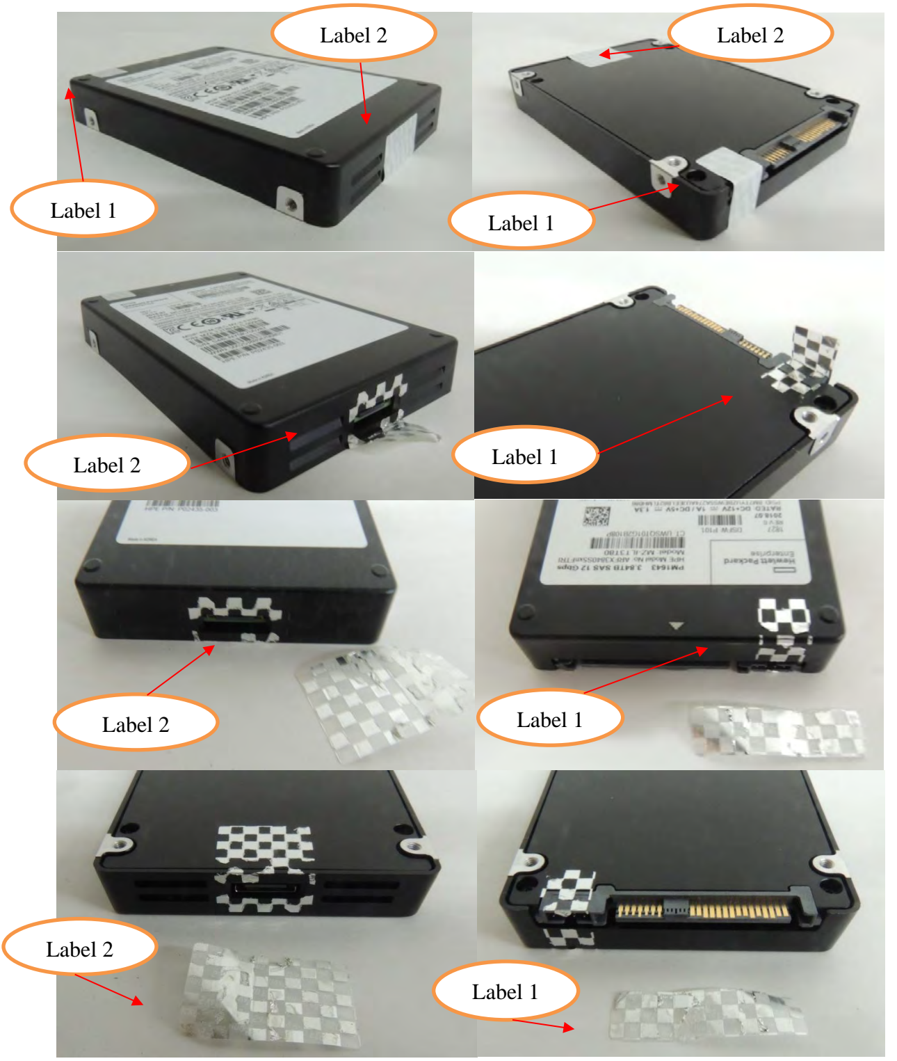
Exhibit 24 – Examples and Signs of Tamper