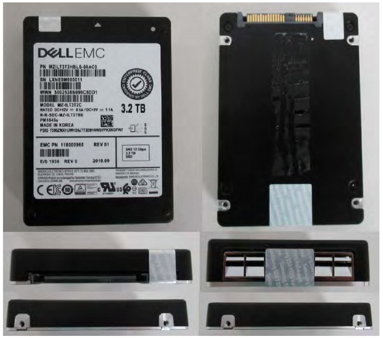
<u>Exhibit 10</u> – Specification of the Samsung SAS 12G TCG Enterprise SSC SEDs PM1643a/PM1645a Series, MZILT3T2HBLS-00AC9, Cryptographic Boundary (From top to bottom – Left to right: top side, bottom side, front side, back side, left side, and right side).