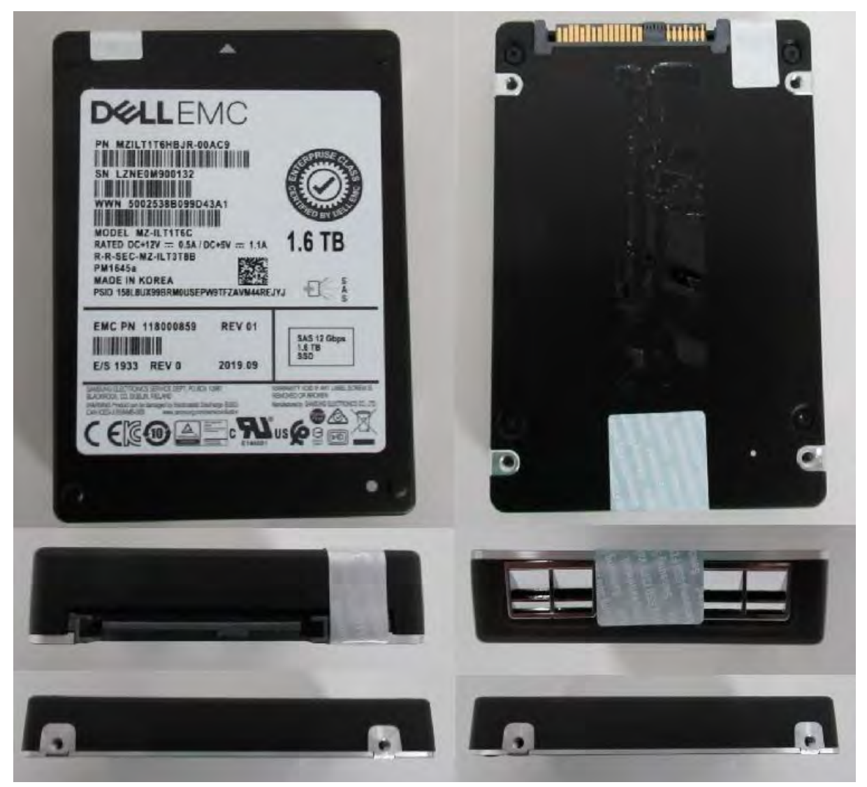
Exhibit 9 – Specification of the Samsung SAS 12G TCG Enterprise SSC SEDs PM1643a/PM1645a Series, MZILT1T6HBJR-00AC9, Cryptographic Boundary (From top to bottom – Left to right: top side, bottom side, front side, back side, left side, and right side).