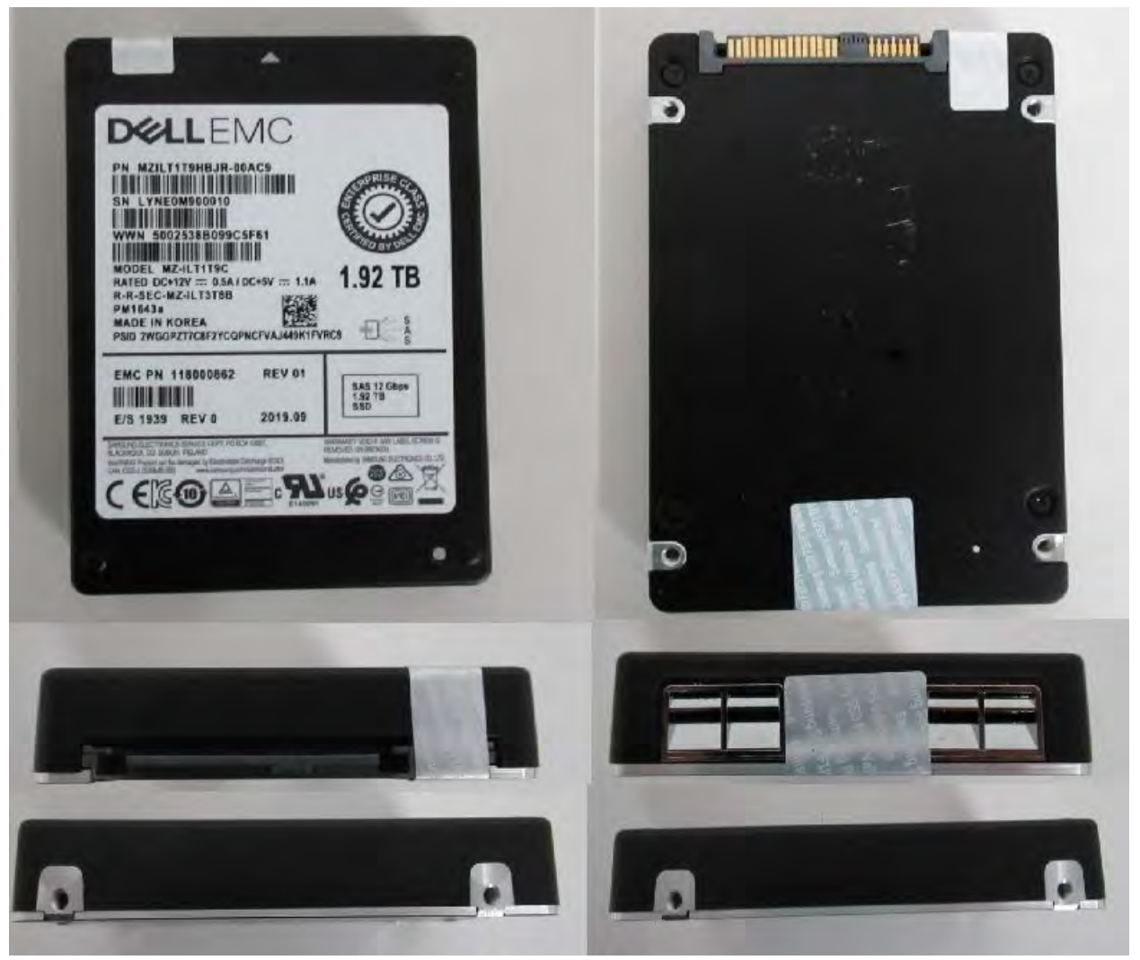
<u>Exhibit 3</u> – Specification of the Samsung SAS 12G TCG Enterprise SSC SEDs PM1643a/PM1645a Series, MZILT1T9HBJR-00AC9, Cryptographic Boundary (From top to bottom – Left to right: top side, bottom side, front side, back side, left side, and right side).