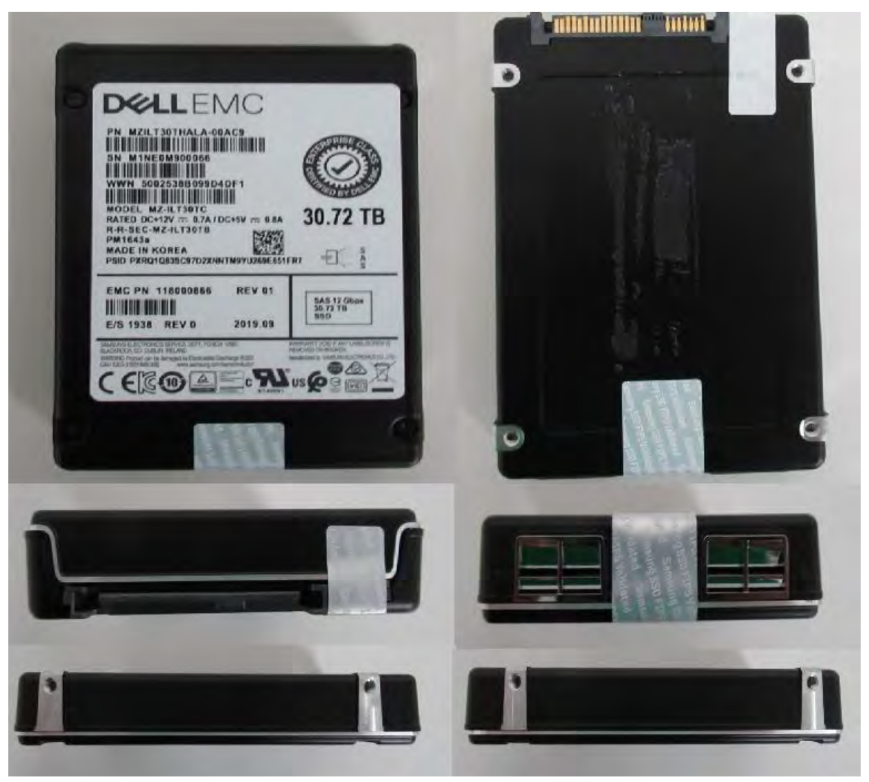
Exhibit 7 – Specification of the Samsung SAS 12G TCG Enterprise SSC SEDs PM1643a/PM1645a Series, MZILT30THALA-00AC9, Cryptographic Boundary (From top to bottom – Left to right: top side, bottom side, front side, back side, left side, and right side).