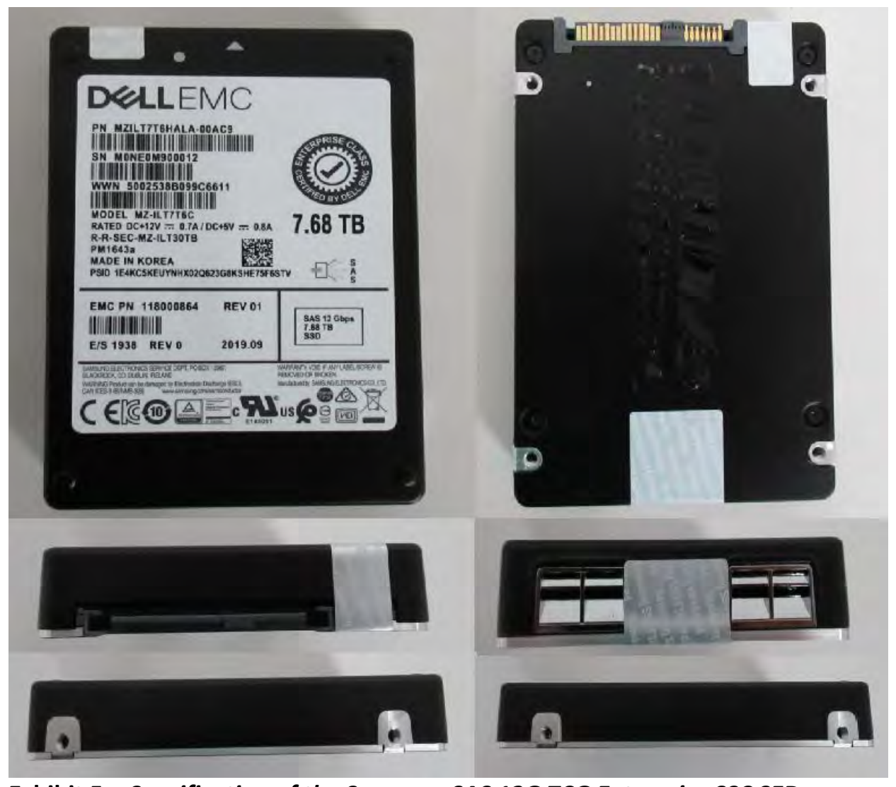
<u>Exhibit 5</u> – Specification of the Samsung SAS 12G TCG Enterprise SSC SEDs PM1643a/PM1645a Series, MZILT7T6HALA-00AC9, Cryptographic Boundary (From top to bottom – Left to right: top side, bottom side, front side, back side, left side, and right side).