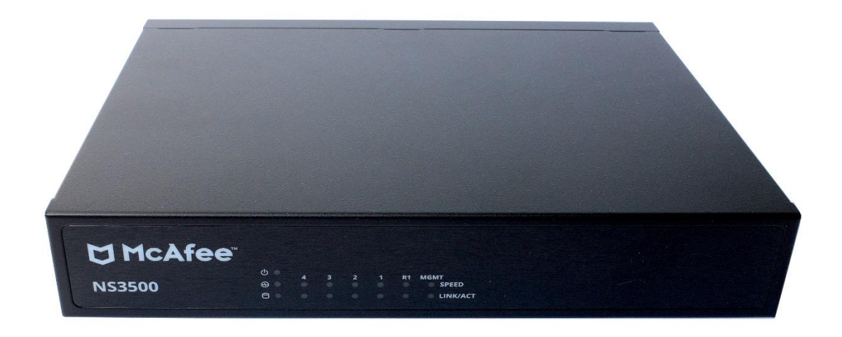
Figure 1 – Images of NS3500

Figure 1 shows the module configuration and the cryptographic boundary.