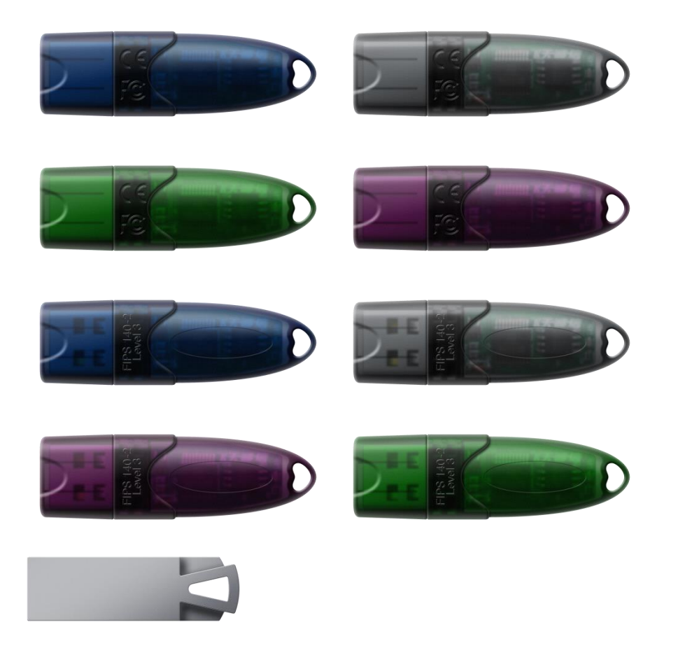
Figure 1 – Feitian ePass Token ePass2003-A2 (top eight) & ePass2003-X18 (bottom left)

This document defines the Security Policy for the ePass2003 cryptographic module, hereafter denoted as the Module. The Module is a USB token containing Feitian's own FT-FIPS-COS which is embedded in a Hongsi HS32 Integrated Circuit (IC) chip and has been developed to support Feitian's ePass2003 USB token. The Module is designed to provide strong authentication and identification and to support network login, secure online transactions, digital signatures, and sensitive data protection.