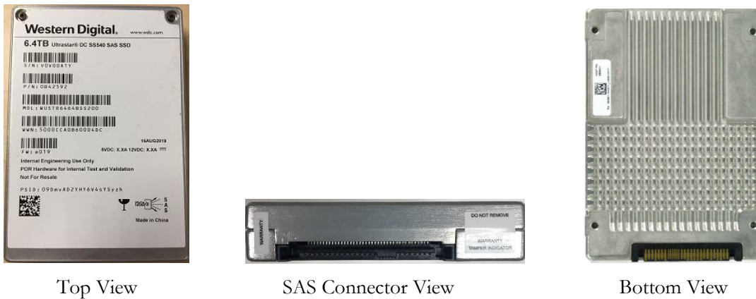
Figure 1: Ultrastar DC SS540 Cryptographic Boundary

The self-encrypting Ultrastar® DC SS540 TCG Enterprise SSD , hereafter referred to as “Ultrastar DC SS540”, or “Cryptographic Module”, is a multi-chip embedded module that comply with FIPS 140-2 Level 2 security. The Cryptographic Module complies with the Trusted Computing Group (TCG) SSC: Enterprise Specification . The drive enclosure defines the cryptographic boundary. See Figure 1: Ultrastar DC SS540 Cryptographic Boundary. All components within this boundary satisfy FIPS 140-2 requirements.