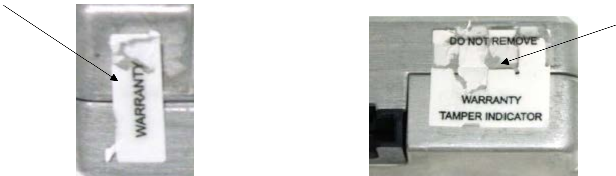
Figure 3: Tamper Evidence on Tamper Seals

The Crypto Officer and/or User shall inspect the Cryptographic Module enclosure for evidence of tampering at least once a year. If the inspection reveals evidence of tampering, the Crypto Officer should return the module to Western Digital.