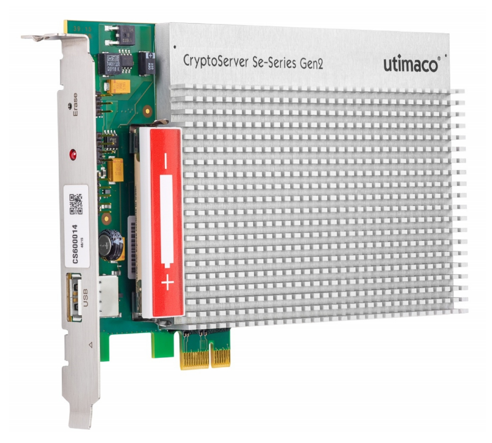
Figure 1 – CryptoComply for HSM version CryptoServer Se-Series Gen2

The picture below shows the CryptoComply for HSM cryptographic module with its PCIe interface: