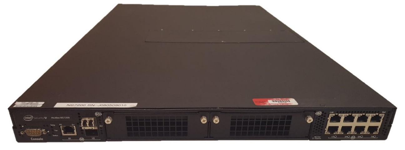
Figure 1 – Image of NS7100/NS7200/NS7300

The cryptographic boundary is the outer perimeter of the enclosure, including the removable power supplies and fan trays. (The power supplies and fan trays are excluded from FIPS 140-2 requirements, as they are not security relevant.) Optional network I/O modules are not included in the module boundary. Figure 1 shows the module configuration and the cryptographic boundary.