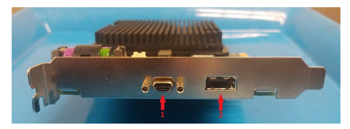
FIGURE 2-2: LUNA T7 CRYPTOGRAPHIC MODULE, PCI BRACKET VIEW

The Physical Ports on the PCI Bracket are shown in Figure 2-2. Port 1 is the Micro-DB9 for the Serial PED cable and Port 2 is the Type A USB 2.0 port for the Backup HSM.