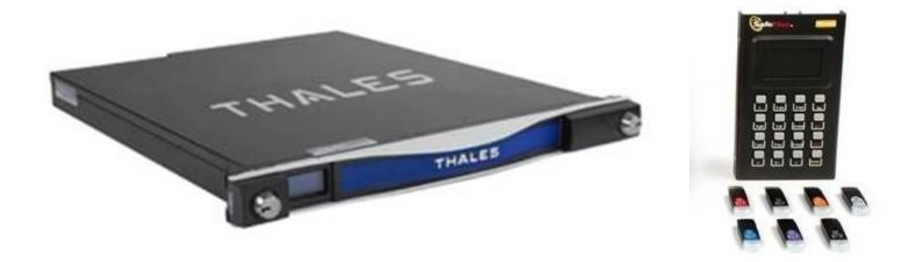
FIGURE 2-3: LUNA NETWORK HSM T-SERIES (WITH T7 INSTALLED), PED AND PED KEYS

Figure 2-3 shows a Luna Network HSM (T-Series), one of the embedments for the Luna T7 Cryptographic Module, and an external PED device and PED Keys.