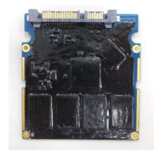
Exhibit 1 – Cryptographic Module Configurations