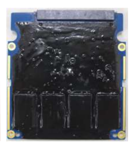
Exhibit 2- Specification of the DIGISTOR 2.5-INCH SATA FIPS SSD Cryptographic Boundary (From left to right: top side, bottom side).