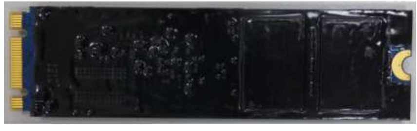
Exhibit 3 - Specification of the DIGISTOR M.2 2280 SATA FIPS SSD Cryptographic Boundary (From top to bottom: top side, bottom side).