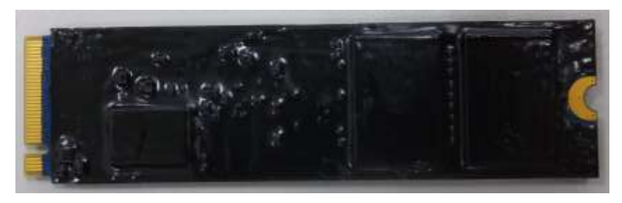
Exhibit 4 - Specification of the DIGISTOR M.2 2280 NVME FIPS SSD Cryptographic Boundary (From top to bottom: top side, bottom side).