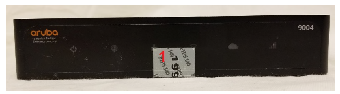
Figure 4 - Required TELs for the Aruba 9004 Series Gateway – Front

• One label spanning the RJ-45 and mini-USB serial ports, as shown in Figures 7, 8 and 9 (Label 4). Press down on this label to ensure that it adheres to a sufficient area of the front bezel. The RJ-45 port is raised relative to the bezel so there will be some air gap under the label in this area. However, the air gap should not be larger than 2-3mm.