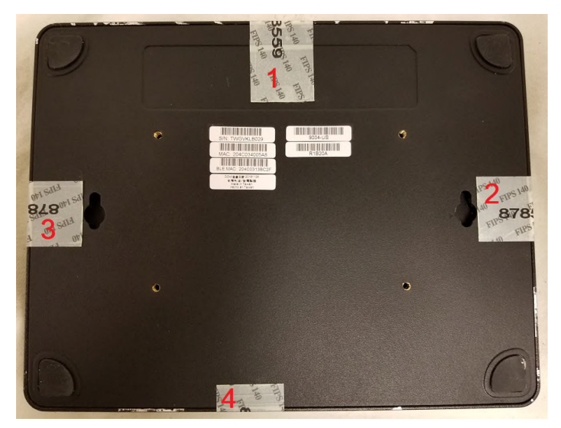
Figure 7 - Required TELs for the Aruba 9004 Series Gateway – Bottom