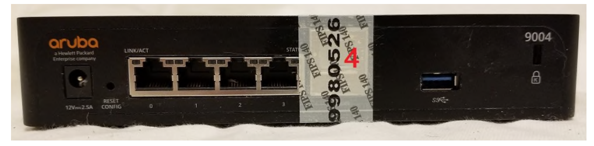
Figure 8 - Required TELs for the Aruba 9004 Series Gateway – Rear