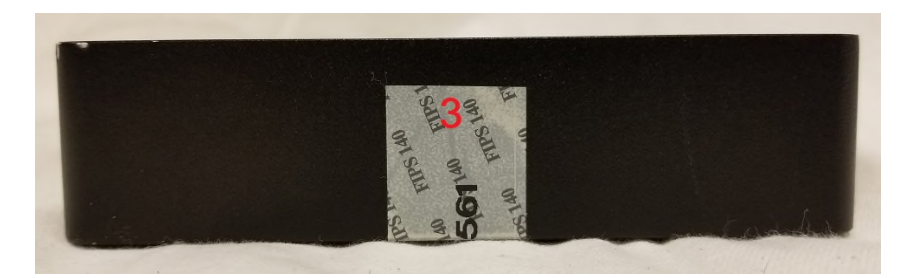
Figure 6 - Required TELs for the Aruba 9004 Series Gateway – Left Side