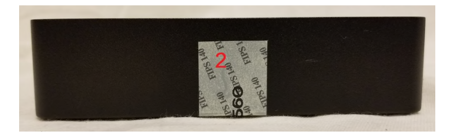
Figure 5 - Required TELs for the Aruba 9004 Series Gateway - Right Side