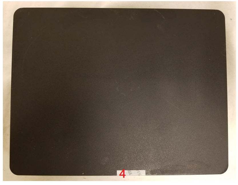
Figure 9 - Required TELs for the Aruba 9004 Series Gateway – Top