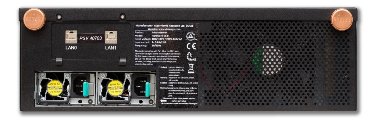
Figure 1 – Tamper Evident cans

The Tamper Evident cans are shown in Figure 1.