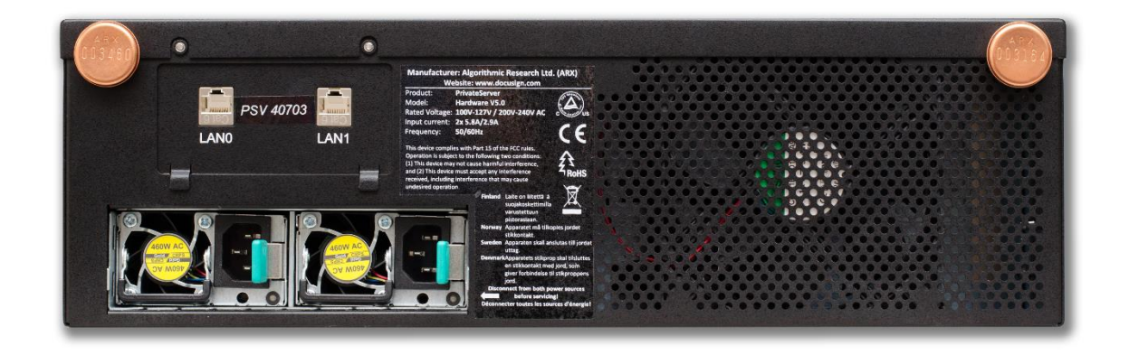
Figure 2 – Front and Rear Interfaces

For FIPS 140-2 purposes, both network ports are treated the same. Through the network ports either an encrypted and RSA based authenticated sessions (Two-way TLS 1.2, using TLS_RSA_WITH_AES_256_CBC_SHA256), or a user ID/password authenticated sessions are permitted over either port when operating in a FIPS 140-2 compliant manner. In a non-FIPS 140-2 compliant manner, the module could be configured so that traffic over the trusted Ethernet port was plaintext while traffic over the non-trusted network was encrypted and authenticated or user-ID/password authenticated.