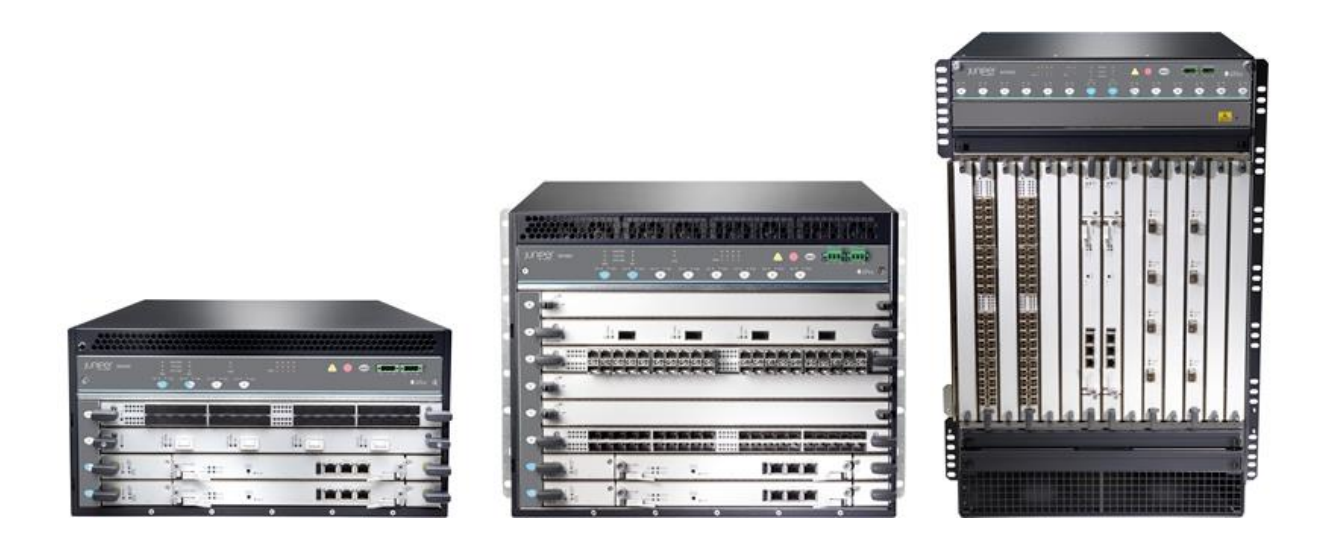
Figure 1 – Physical Cryptographic Boundary (Left to Right: MX240, MX480, MX960)

The image below depicts the physical boundary of the modules. The boundary includes the Routing Engine, MS-MPC, and SCB/SFB. The boundary excludes the non-crypto-relevant line cards included in the figure. The modules exclude the power supplies from the requirements of FIPS 140-2. The power supplies do not contain any security relevant components and cannot affect the security of the module.