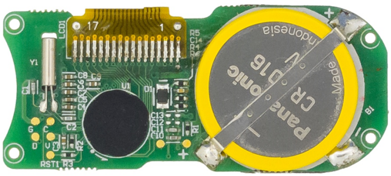
Figure 2 - Feitian OTP Token (Front and Back)

The module's ports and associated FIPS defined logical interface categories are listed in Table 3.