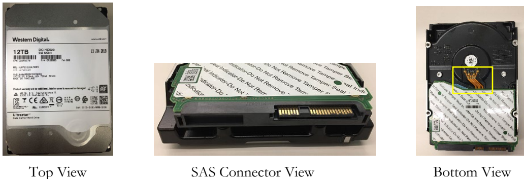
Figure 3: Ultrastar DC HC520 Cryptographic Boundary, Hardware Version 1