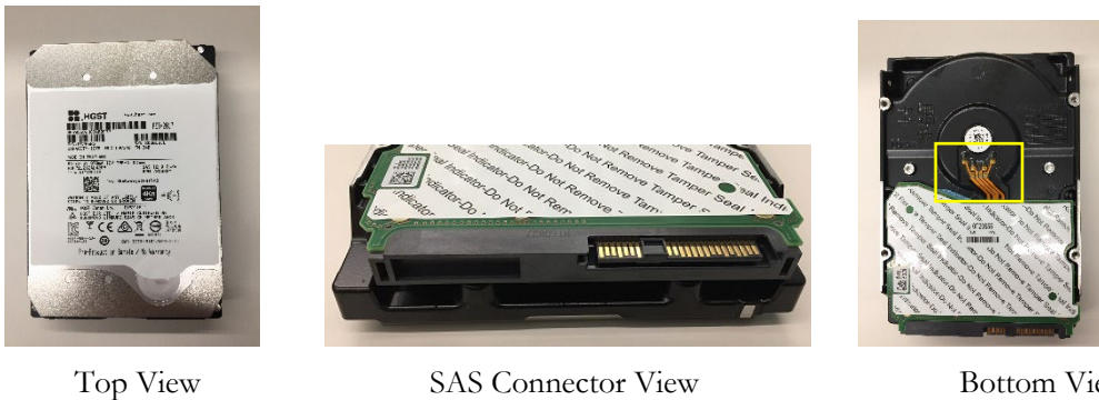
Figure 1: Ultrastar He 12 Cryptographic Boundary, Hardware Version 1

The self-encrypting Ultrastar® He 12 TCG Enterprise HDD and Ultrastar® DC HC520 TCG Enterprise HDD , hereafter referred to as “Ultrastar He 12 ”, “Ultrastar DC HC520” or “the Cryptographic Module” is a multi-chip embedded module that complies with FIPS 140-2 Level 2 security. The Cryptographic Module complies with the Trusted Computing Group (TCG) SSC: Enterprise Specification . The drive enclosure defines the cryptographic boundary. The SIO port pins outlined by the red boxes within the SAS connector view of Figure 2 and Figure 4 are disabled in FIPS Approved Mode and non-Approved Mode. Except for the four-conductor motor control cable, shown in the yellow box of the bottom view of Figures 1 through Figure 4, all components within the cryptographic boundary tested as compliant with FIPS 140-2 requirements. The control cable is not security relevant and therefore excluded from FIPS 140-2 requirements. The Ultrastar DC HC520 complies with the Advanced Format (AF) standard. The logical storage of user data is unaffected by the formatting method for drives that comply with the Advanced AF standard. 4Kn and 512e formatting organize user data on the physical media in the same manner. The emulation layer employed in 512e drives only services to organize the data in 512-byte chunks for processing by the host. Format method is not security relevant and therefore excluded from FIPS 140-2 requirements.