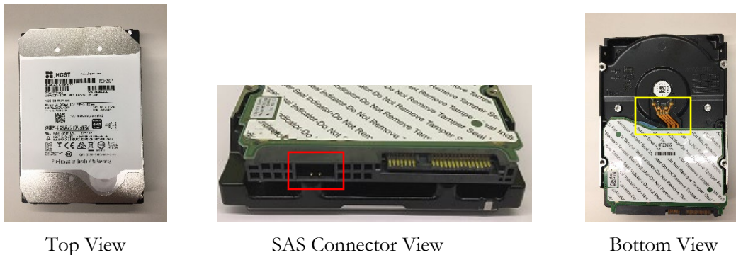
Figure 2: Ultrastar He 12 Cryptographic Boundary, Hardware Version 2