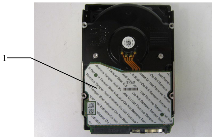
Figure 5: Tamper-Evident Seal