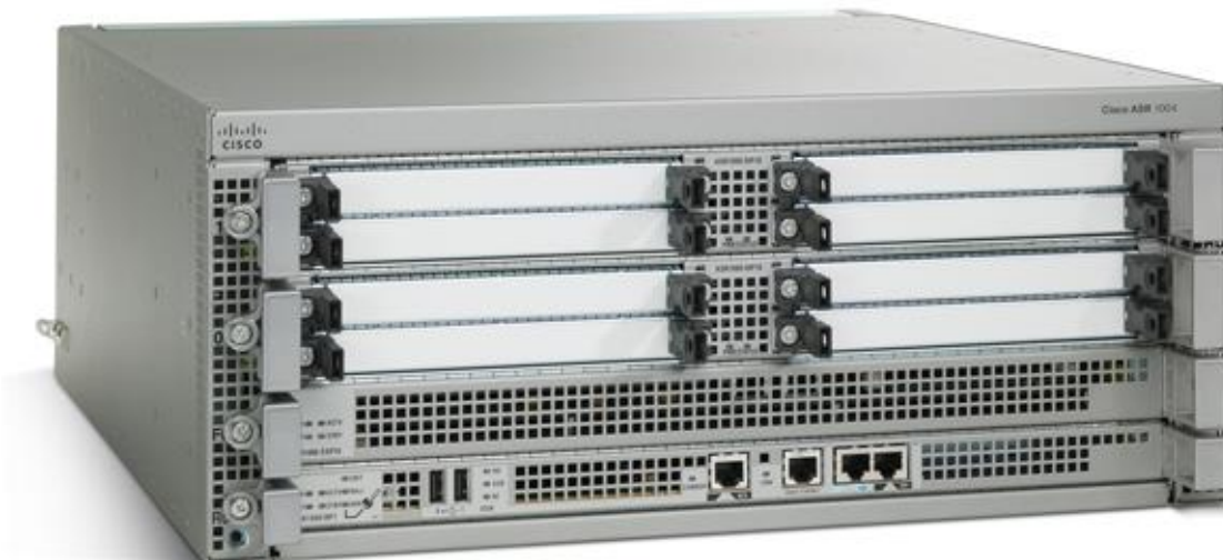
Figure 2: ASR 1004