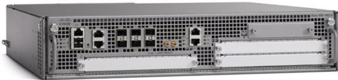
Figure 1: ASR 1002-X

With routing performance and IPsec Virtual Private Network (VPN) acceleration around ten-fold that of previous midrange aggregation routers with services enabled, the Cisco ASR 1000 Series Routers provides a cost-effective approach to meet the latest services aggregation requirement. This is accomplished while still leveraging existing network designs and operational best practices.