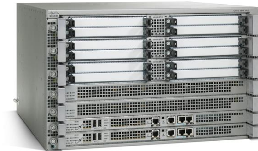
Figure 3: ASR 1006