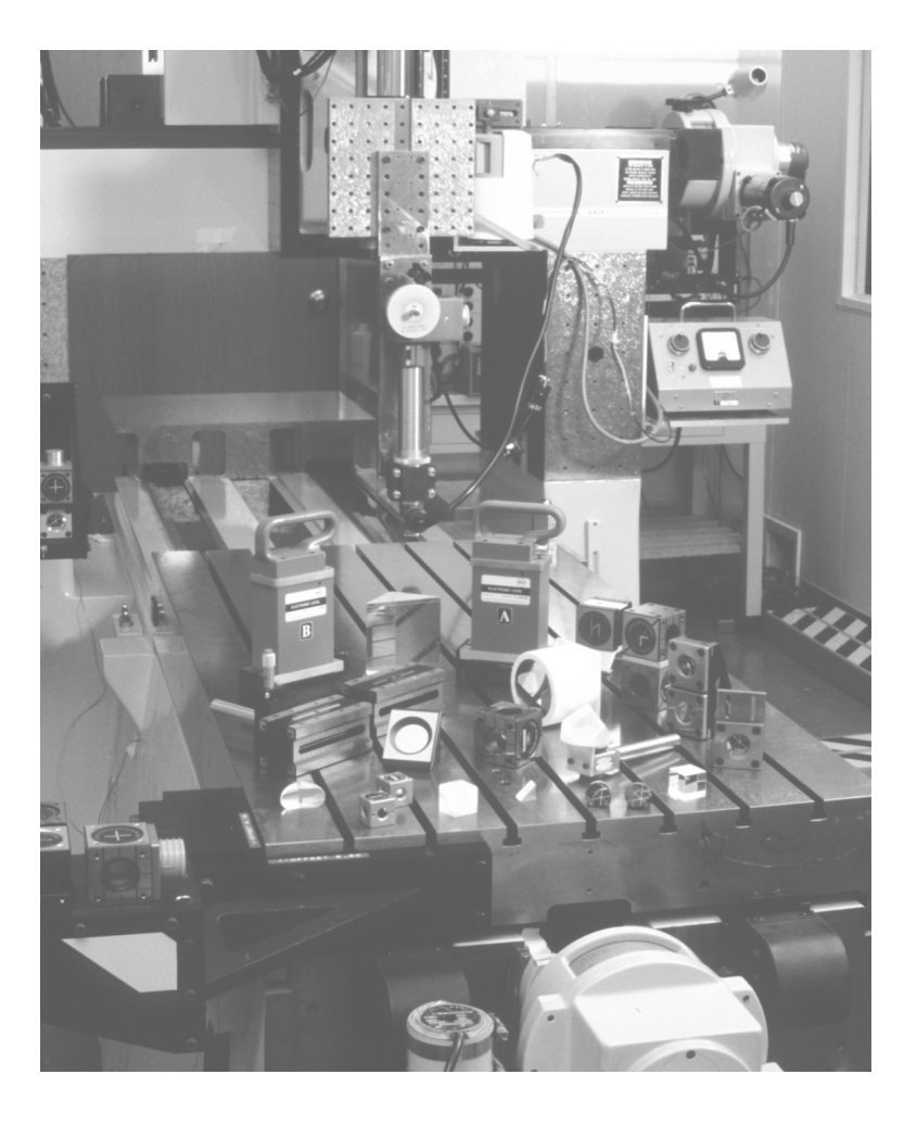
Fig. 3. M5Z and some of the equipment needed to measure the error motions of the three axes.

and consequently can be characterized fairly well with simpler measurements. For example, measurement of the table pitch along only one line, rather than a number of measurements along parallel lines, can be used. An early project to implement this simpler "rigid body" error map was completed at NBS in the early 1980s [6].