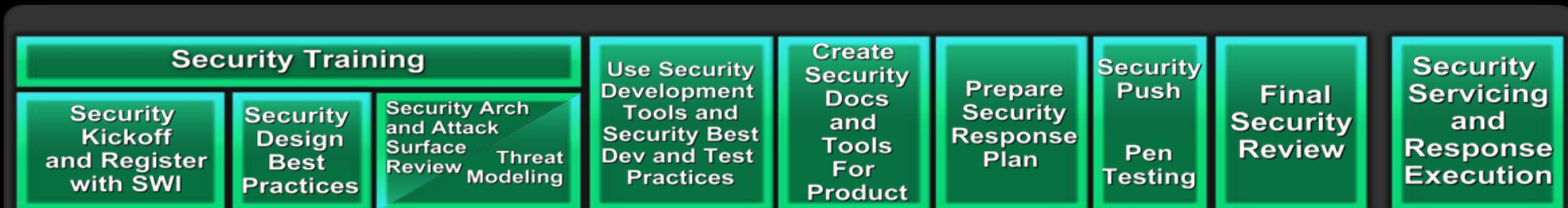
Traditional Microsoft Software Product Development Lifecycle Tasks and Processes