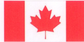
The Communications Security Establishment of the Government of Canada