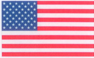
The National Institute of Standards and Technology of the United States of America