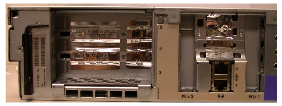
Figure 5: Rear Tamper Seals