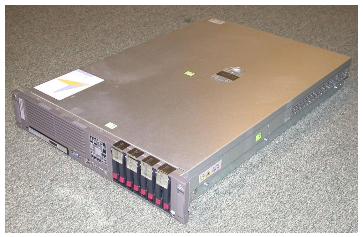
Figure 1 – Image of the Cryptographic Module

The Accellion Secure File Transfer Appliance (HW P/N ACFIPS-01 Version 1.0.0; FW Version FTA_8_0_3, FTA_8_0_136, and FTA_8_0_488) is a multi-chip standalone cryptographic module as defined in the FIPS 140-2 standard. The cryptographic boundary is the external surface of the hard, opaque, commercial grade metal case. The primary purpose for this device is to provide data security for file transfers.