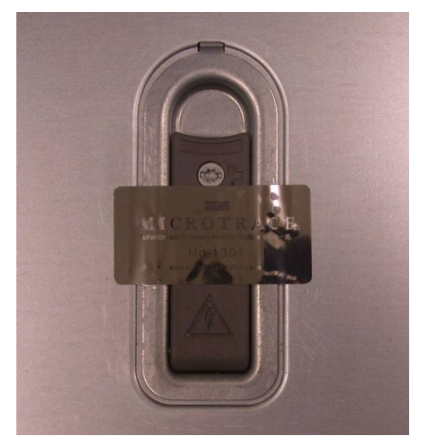
Figure 3: Tamper Evident Seal on Top Cover Latch