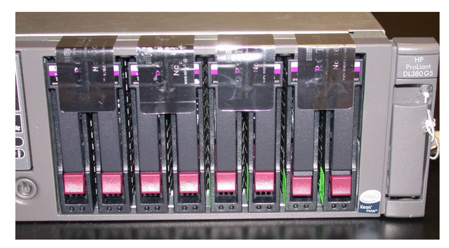
Figure 4: Tamper Seals over Front Hard Drives