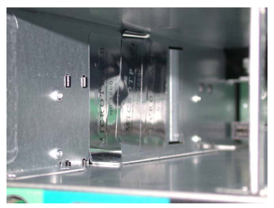
Figure 6: Tamper Seals inside Left Power Supply Slot