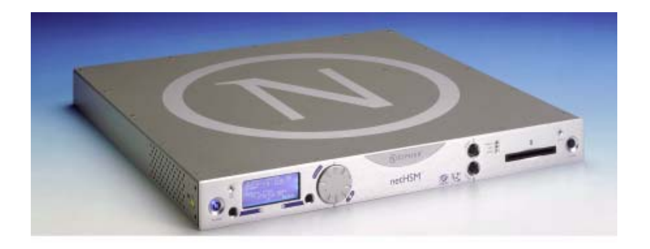
The following figure shows the module mounted inside the NetHSM