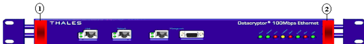
Figure 4-1 1600X439, Rev. 01 Front