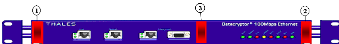
Figure 4-4 1600X439, Rev. 02 Front