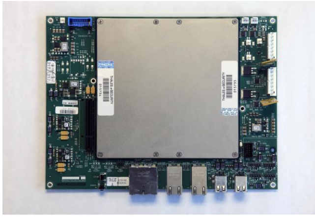
Figure 1: TSPP-B

TSPP contains a protected non-volatile memory that can be used by applications to contain confidential key material.