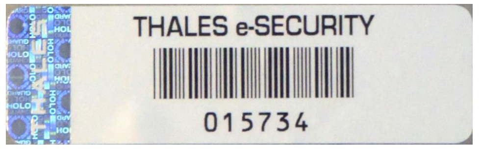
Figure 3: Close-up of Thales tamper-evident label

Figure 3 shows the enlarged image of the Thales tamper-evident label. Note that the labels have rounded corners – i.e. the grey corners of this picture are not a part of the label. As shown, the left-hand end of the label has a holographic background image. If there is an attempt to peel the label from the metal cover, the surface will discolour; and, in the darkening colour, the word "VOID" will appear and will remain visible even if the label is pressed back to the surface of the cover. Any significant damage to either label directly above the protected screw heads may indicate attempts at tampering with the module.