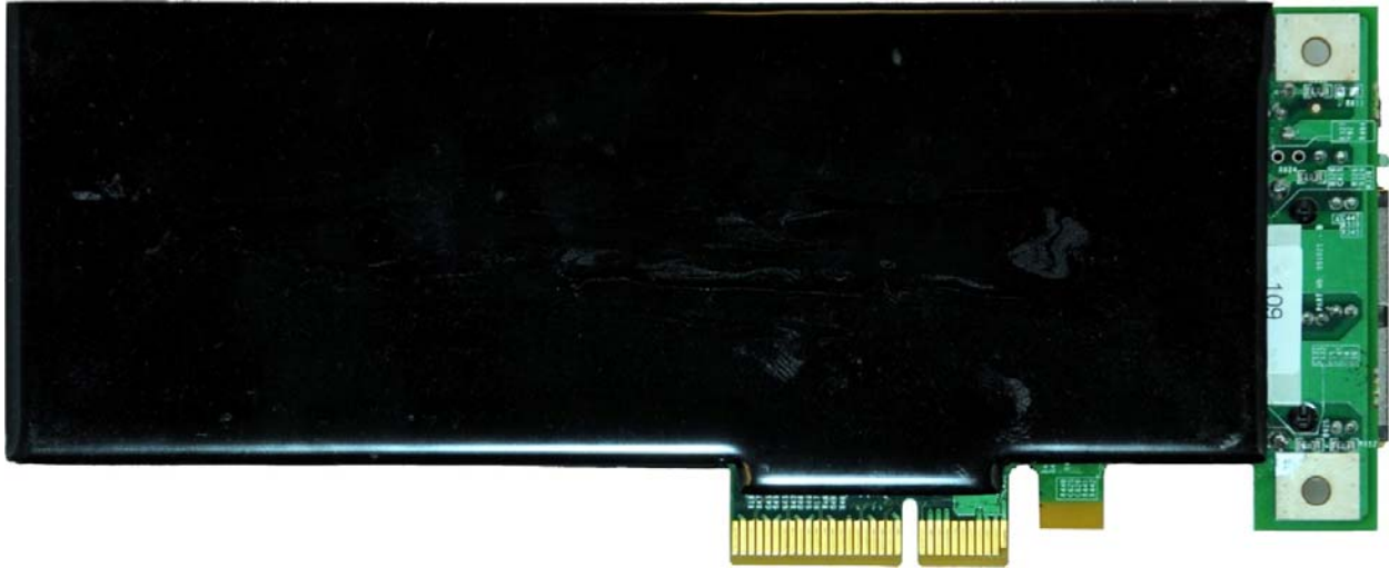
Figure 2 – Bottom view of Cryptographic Module

The configuration of hardware and firmware for this validation is: